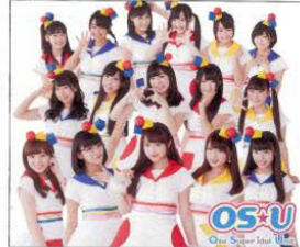
Local Idol Groups