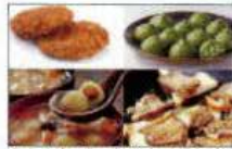
Specialty foods from Tohoku