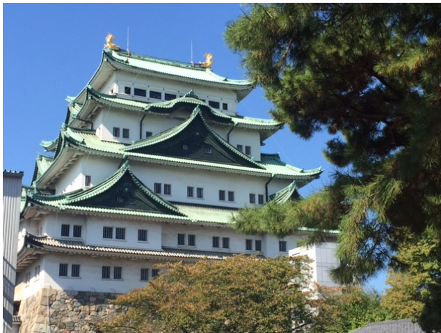
The culturally significant Nagoya Castle