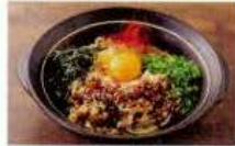
Kamatama Ramen (Miso ramen with Nagoya Cochin egg) (Won grand prize at Nagoya-meshi Expo 2014)

※Photograph is for illustrative purposes