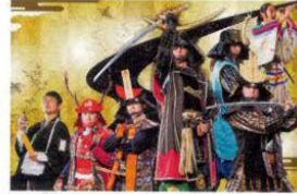
Local Samurai Groups