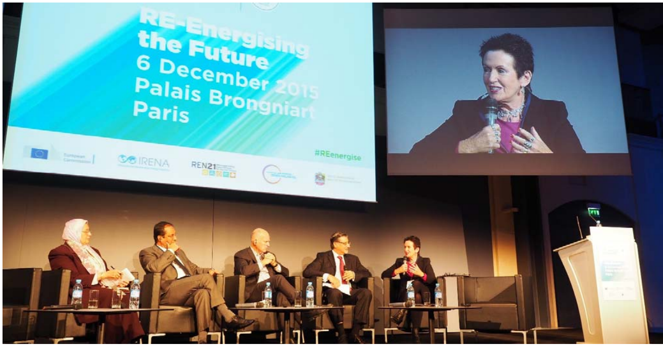
'Governments Leading the Way Towards a Renewable World', Panel discussion moderated by the International Renewable Energy Agency, Director-General, Mr Adnan Z. Amin

Hosted by the European Commission (EC), the International Renewable Energy Agency (IRENA), the Renewable Energy Policy Network for the 21st Century (REN21) French Syndicate for Renewable Energy (SER), and the Ministry of Foreign Affairs of the United Arab Emirates.