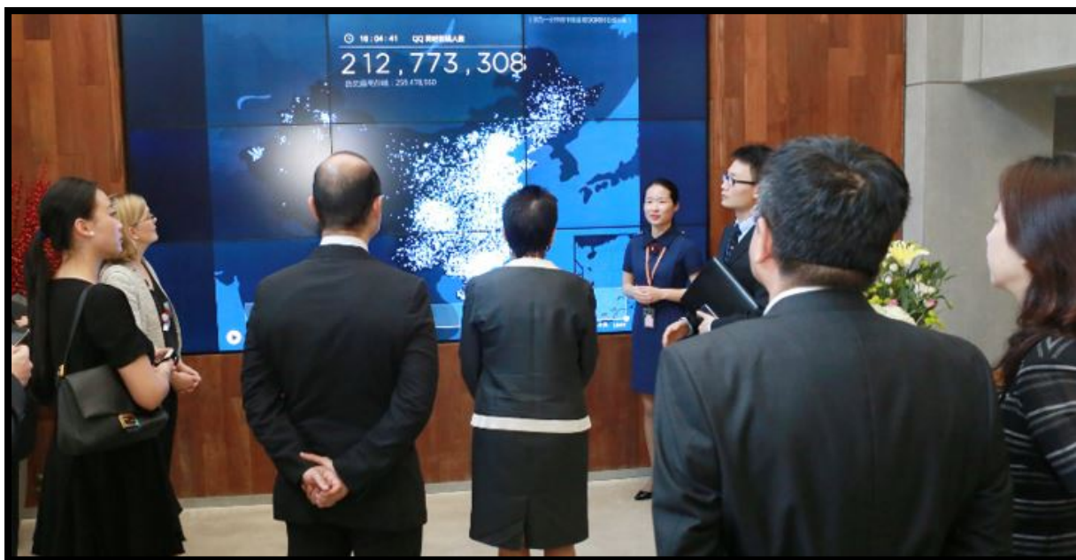
Image 11: Visit to the headquarters of WeChat, a messaging service used by 700 million people.