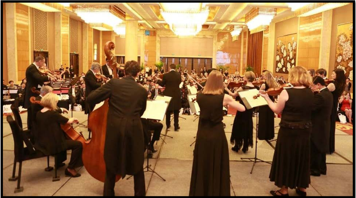
Image 3: Concert by the Sydney Symphony Orchestra for participating delegates and local dignitaries.

different perspective to the understanding of music, and that he still remembers the new ideas feeling like a breath of fresh of air.