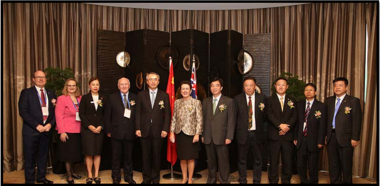
Image 9: Official delegation at the launch of the Guangzhou-Sydney Business Summit in Guangzhou.

Examples of business opportunities arising from the Sydney-Guangzhou Business Summit include: