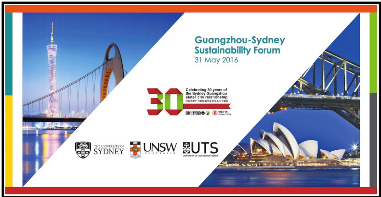
Image 5: Sustainability forum hosted by the University of Sydney, University of Technology Sydney and the University of New South Wales.

“This is the best opportunity to share ideas and links across the academic industry on sustainability. The Guangzhou forum is a vital opportunity to create a research agenda with a focus on bringing water, waste, energy, resources and researchers together.”