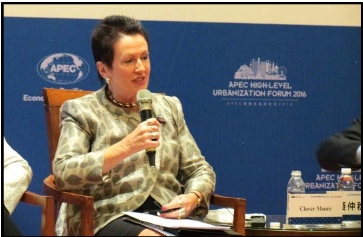
Image 14: Lord Mayor Clover Moore presents to the APEC High Level Urbanisation Forum in Ningbo on the City's approach to urban renewal, focusing on doing density well to maintain a liveable, sustainable city.

I joined a panel session with the Chinese Vice Minister of Housing and Urban-Rural Development, the Deputy Assistant Secretary of the US Department of Housing and Urban Development and representatives from the Singaporean Ministry of National Development as well as the mayors of Ningbo and Xi'an and a representative from Tokyo.