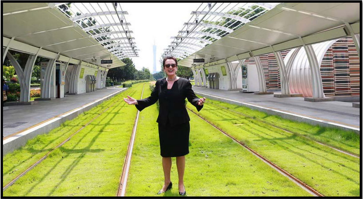
Image 8: Green tracks at the Pazhou light rail station, Guangzhou.

It's quiet and flexible to suit commuter needs. And look at the beautifully grassed track! I will continue to push for a similar approach for the CBD and City South light rail, especially in Surry Hills.