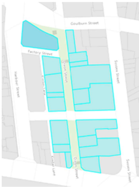
Figure 2. Map of Dixon Street south properties