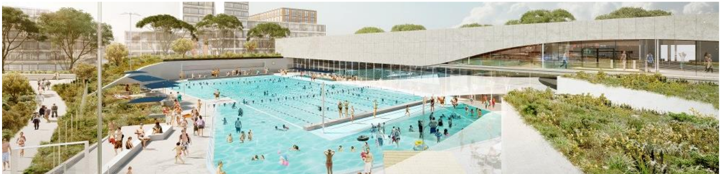
Gunyama Park Aquatic and Recreation Centre: artist impressions