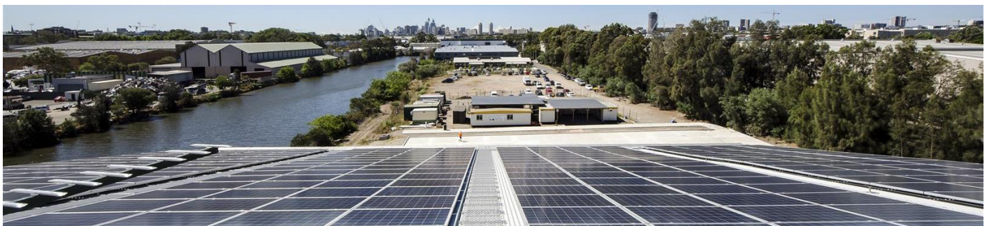
Alexandra Canal Depot: Photovoltaic Solar Installation