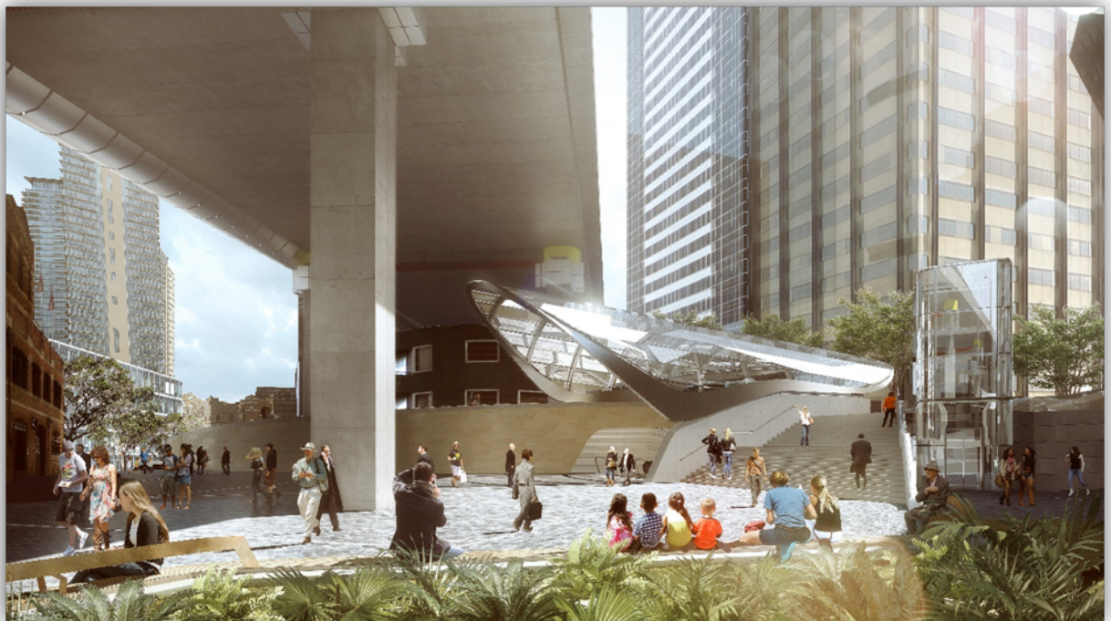
View towards Napoleon Street