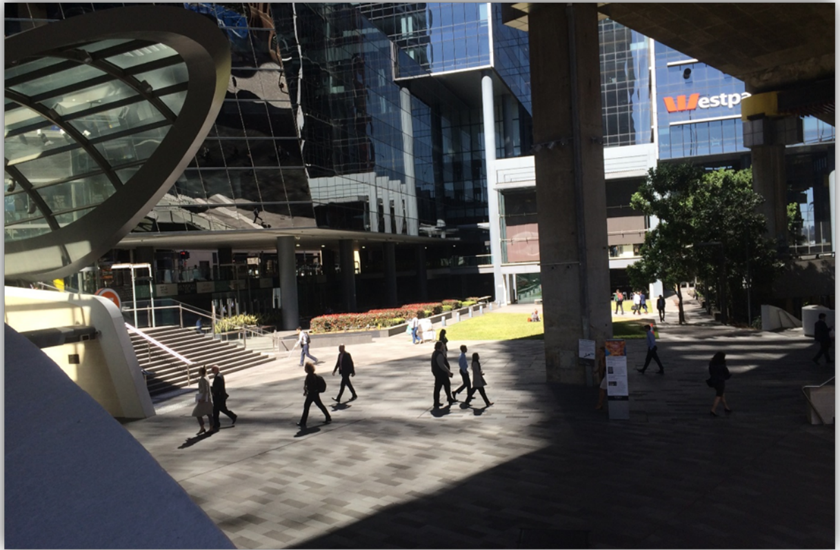
View from Napoleon Street