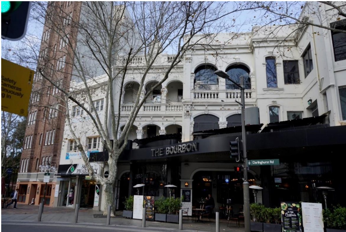
Figure 4: The facade of The Bourbon at 22-24 Darlinghurst Road, Potts Point