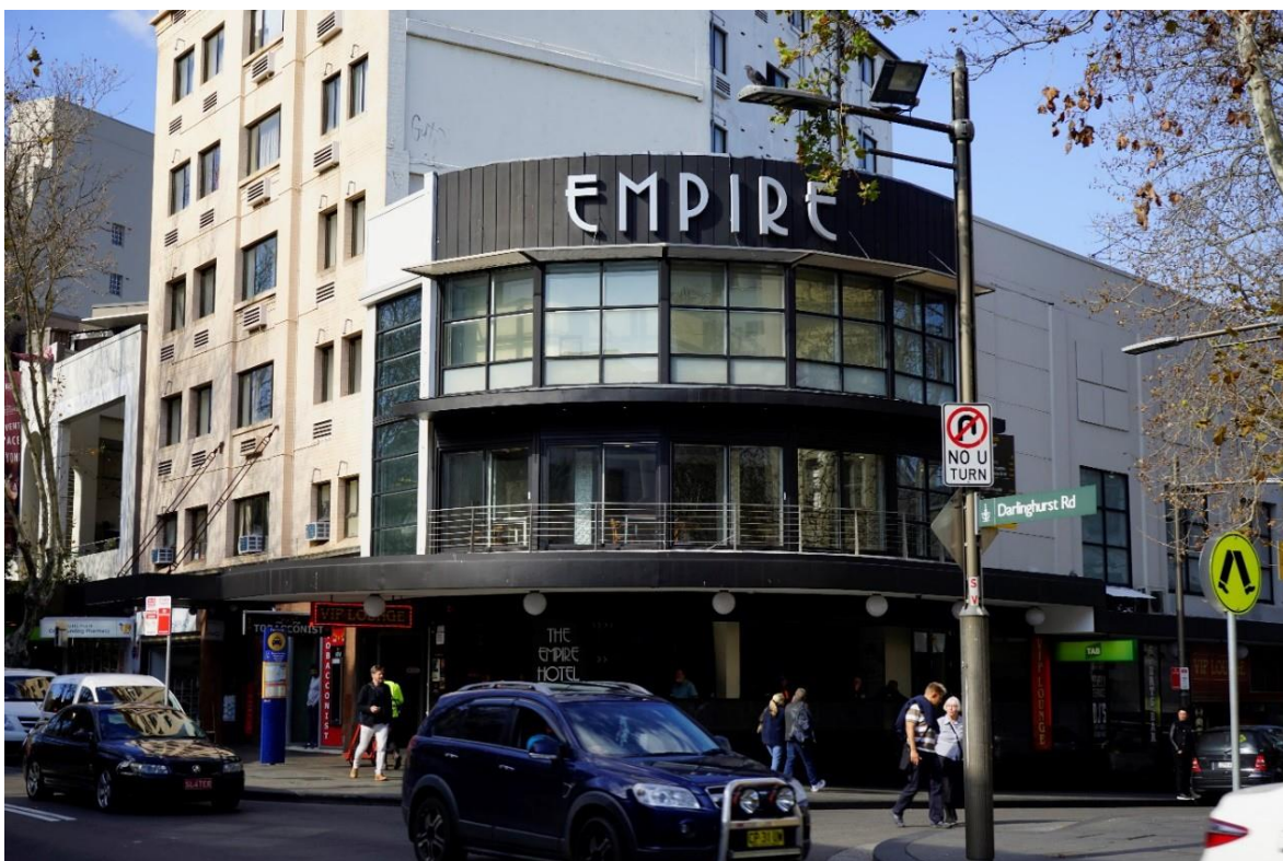
Figure 5: The facade of The Empire at 32-32A Darlinghurst Road, Potts Point