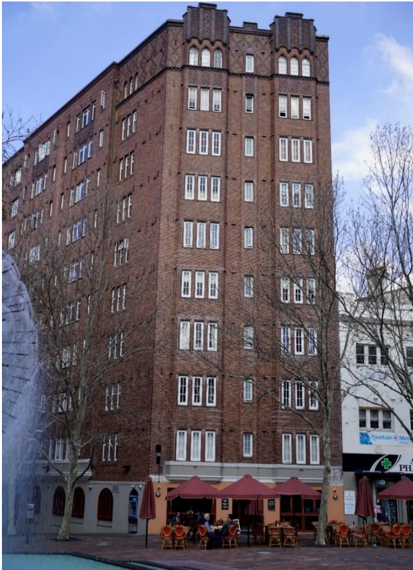
Figure 3: Kingsley Hall at 1A Elizabeth Bay Road, Potts Point