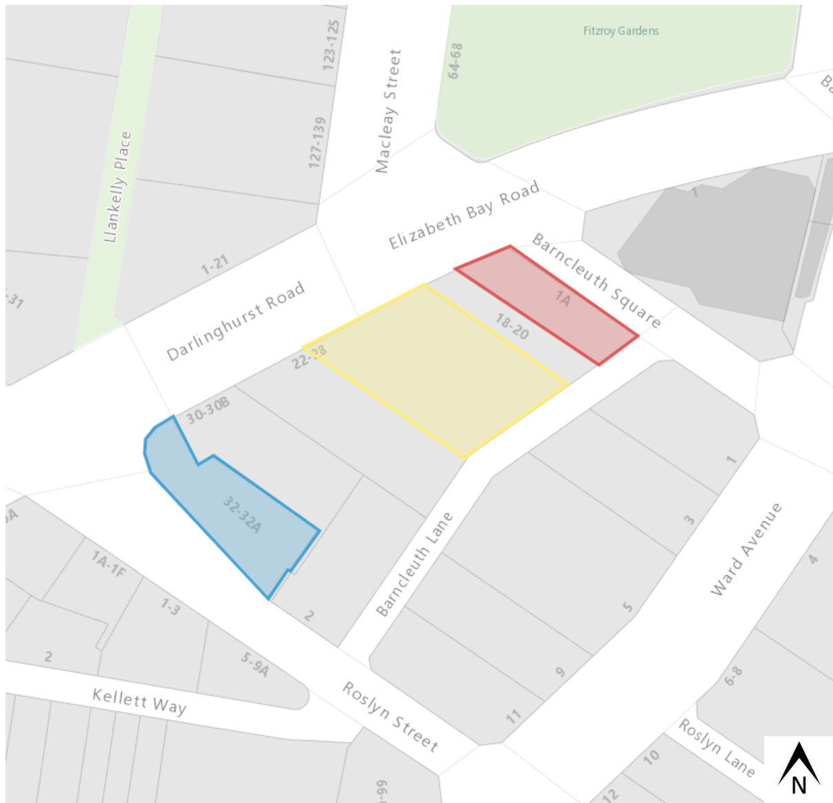
Figure 1: Map of subject sites - 1A Elizabeth Bay Road (Kingsley Hall) in red, 22-24 Darlinghurst Road (The Bourbon) in yellow and 32-32A Darlinghurst Road (The Empire) in blue.