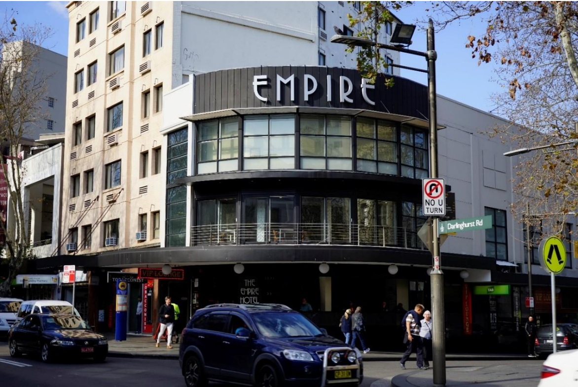
Figure 5: The facade of The Empire at 32-32A Darlinghurst Road, Potts Point