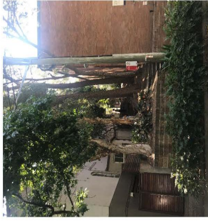
Existing site condition from Bourke Street