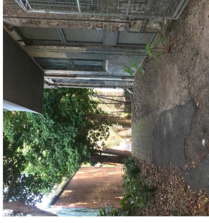
Existing site condition from Thomson Street