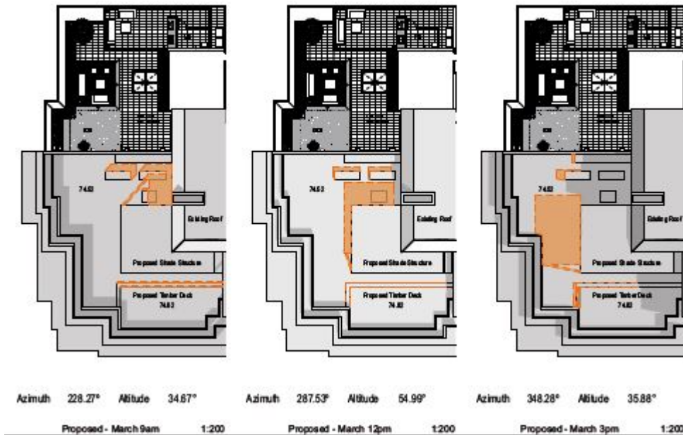
Figure 1 Proposed Pergola showing no impact on neighbouring rooftop

The proposal seeks to provide a covered pergola with bathroom to meet the needs of the owners. It will provide increased amenity and does not result in any adverse impacts on the area.