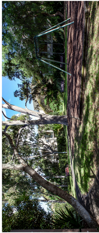
Existing Site Condition