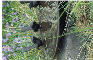
Bird bath - indicative only