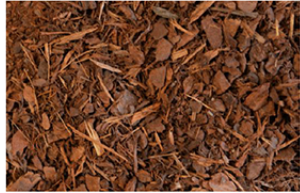
Bark mulch soft-fall