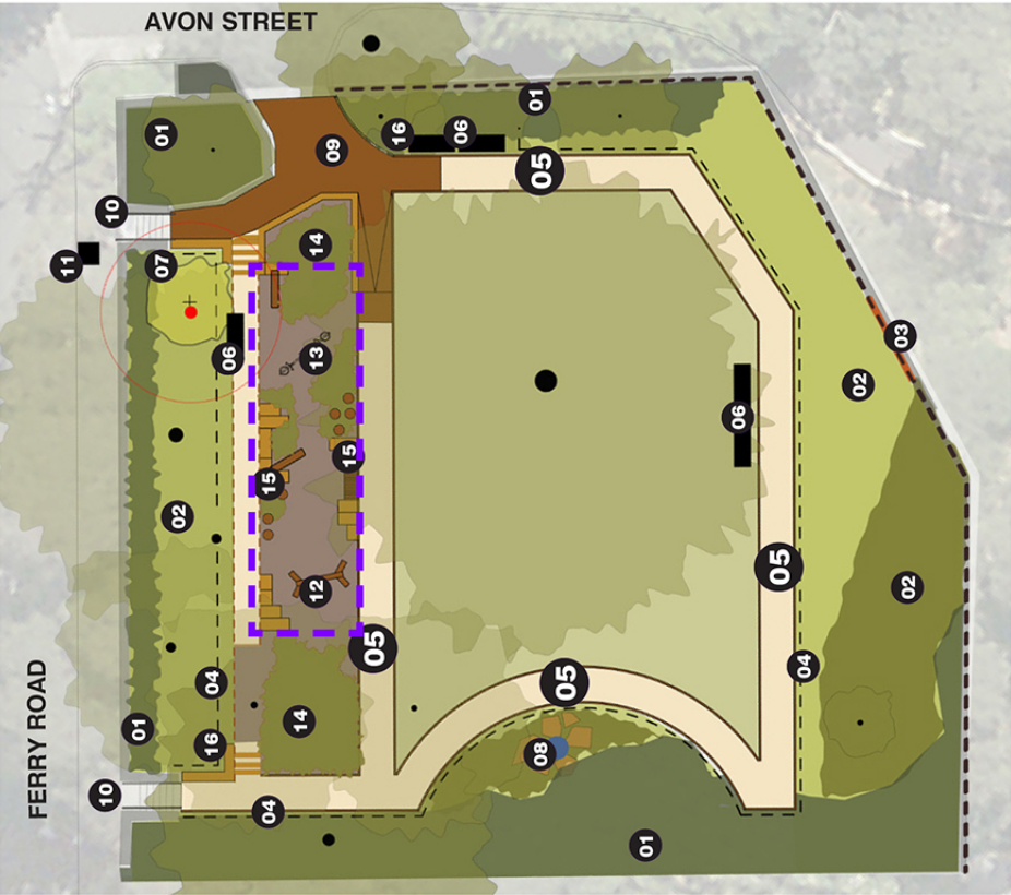
Revised concept plan