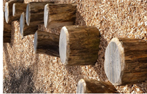
Timber nature play