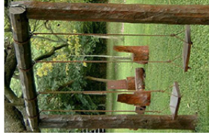
Timber swing- indicative only