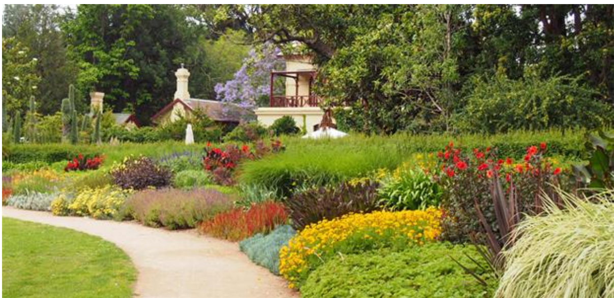
Photo of the perennial border outside Garden House in the Melbourne Botanic Garden