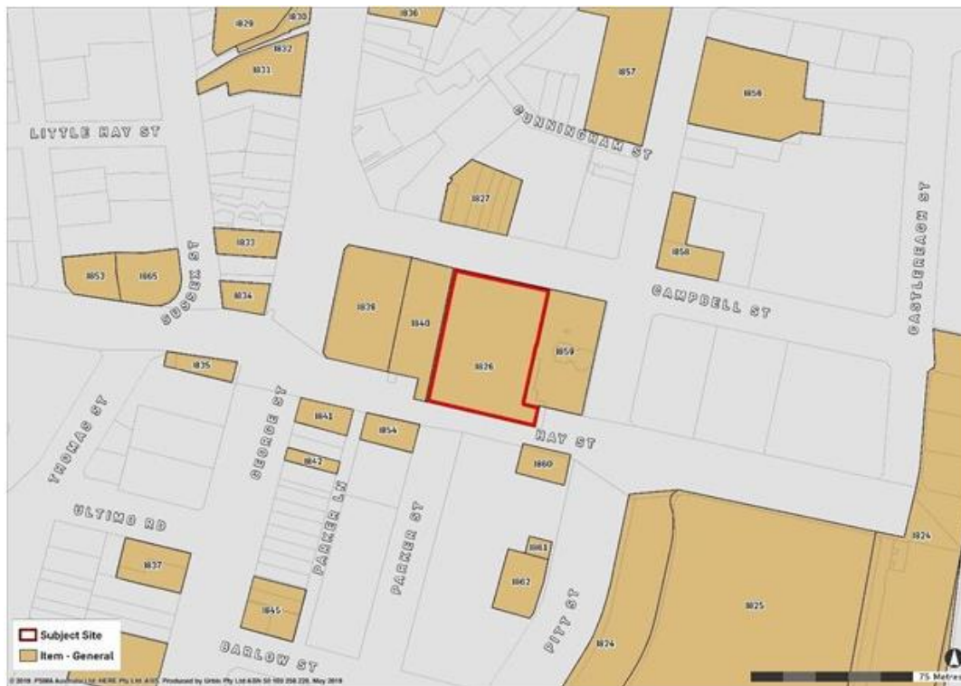
Figure 1 Sydney LEP 2012 Heritage Map excerpt.

8. The site is owned by the City of Sydney.