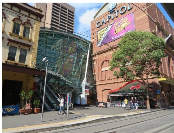
Figure 5 – View of Hay Street elevation with Capitol Square (centre) and Capitol Theatre (right)