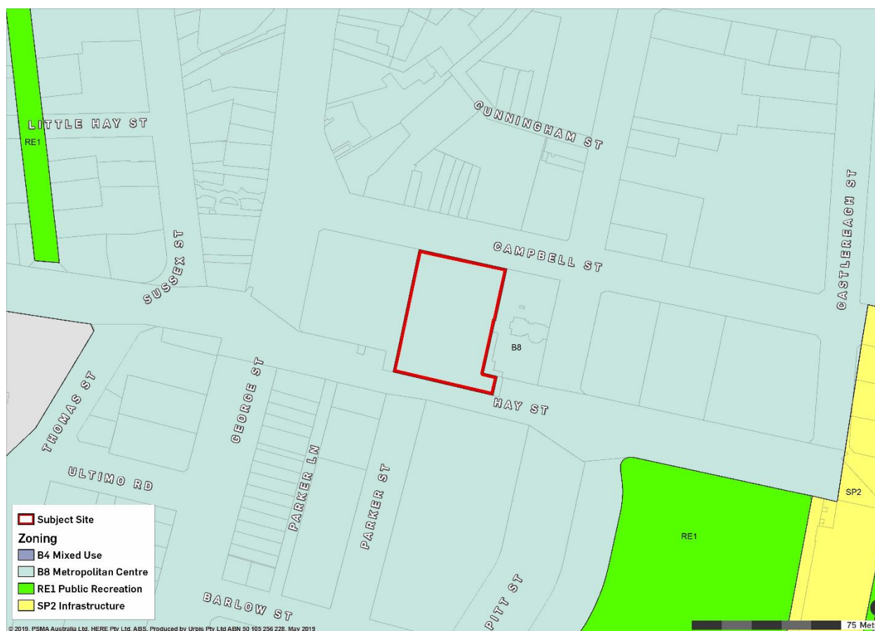
Figure 9 – SLEP 2012 Zoning Map

As illustrated in Figure 9 , the site is located in the B8 Metropolitan Centre Zone under the SLEP 2012.