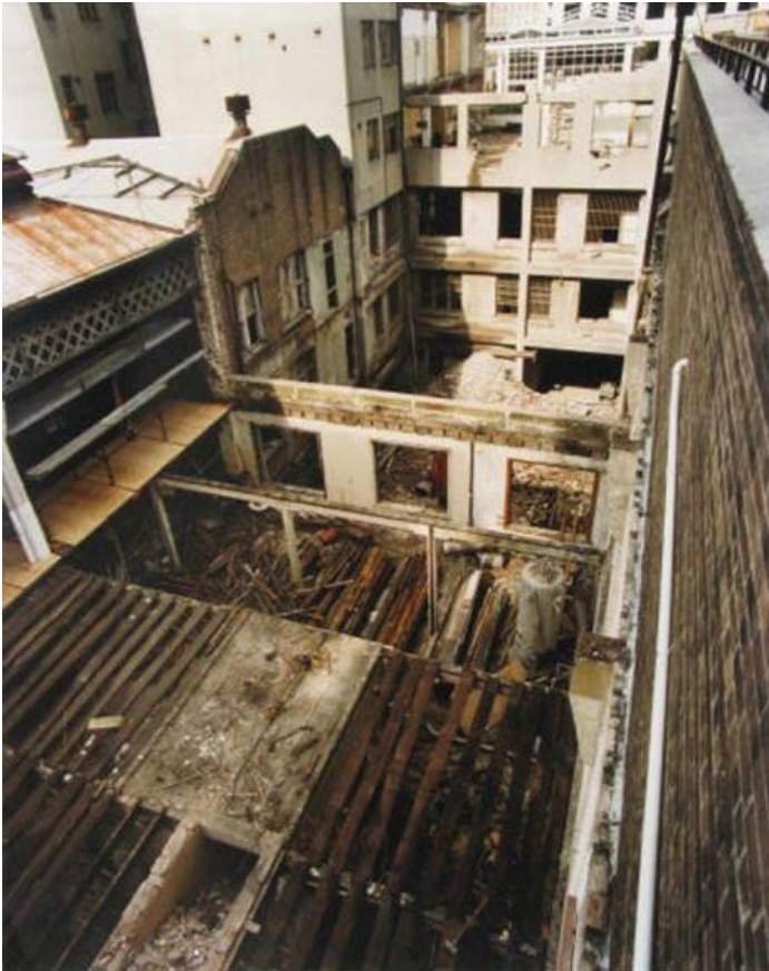
Picture 1 - Elevated view of Manning Building demolition during restoration of theatre.