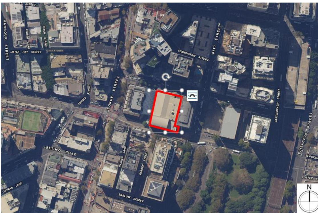
Figure 1 – Location Plan

The building directly abuts the Manning Building to the east and Capitol Square to the west. In proximity to the site is the Corporation Building (to the south), the Palace Hotel (to the west) and three storey terrace buildings and commercial towers on the north side of Campbell Street. The light rail line runs directly to the south of the Capitol Theatre along Hay Street. The City Circle railway line runs directly underneath the site.