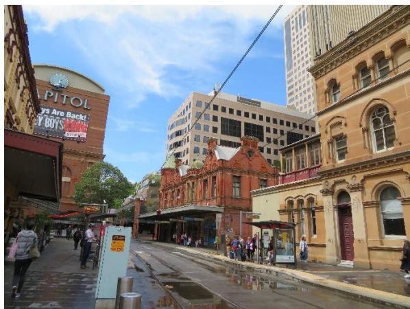
Figure 2 – Looking south-east from corner of Hay and George Street, with Haymarket Library and the Corporation Building (right of centre)

The public entries into the Capitol Theatre are located on Campbell Street and provide entrance into the Box Office, within the north-east portion of the building and also into the theatre foyers. At the corner of Hay and Pitt Street is the loading dock and stage door. No public access is provided from Hay Street.