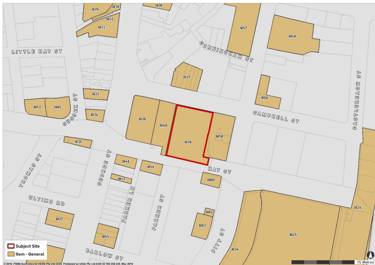
Figure 8 – SLEP 2012 Heritage Map