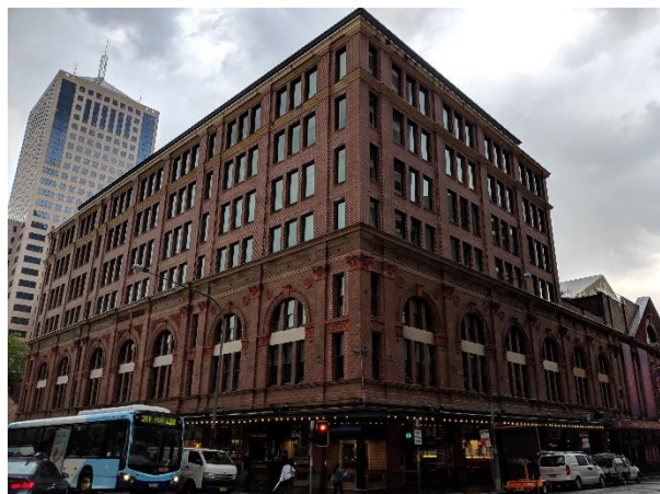
Figure 3 – Manning Building adjoining the site, viewed from the corner of Pitt and Campbell Streets