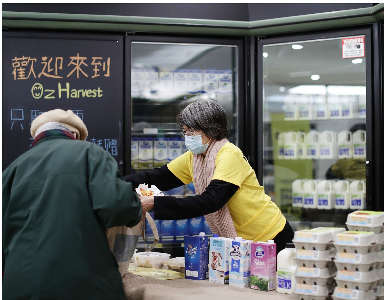
OzHarvest supermarket in the Waterloo Estate provides hampers, groceries and other essential items to vulnerable residents. The supermarket was made possible following a $1 million City of Sydney grant. July 2020.