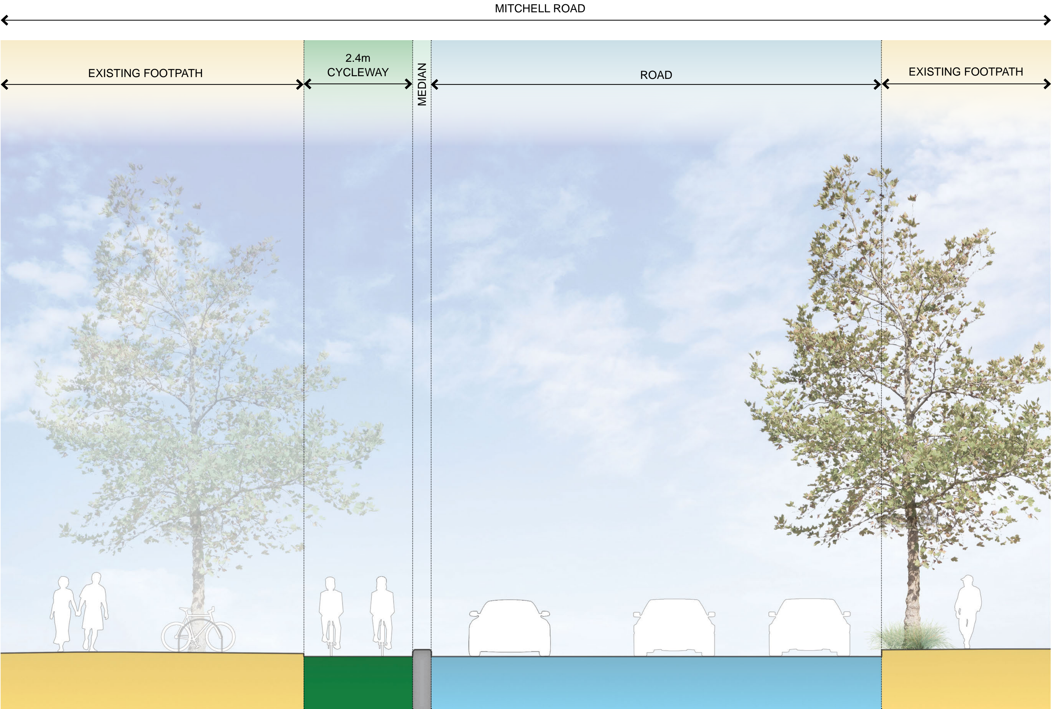
TYPICAL STREET CROSS SECTION A-A MITCHELL ROAD