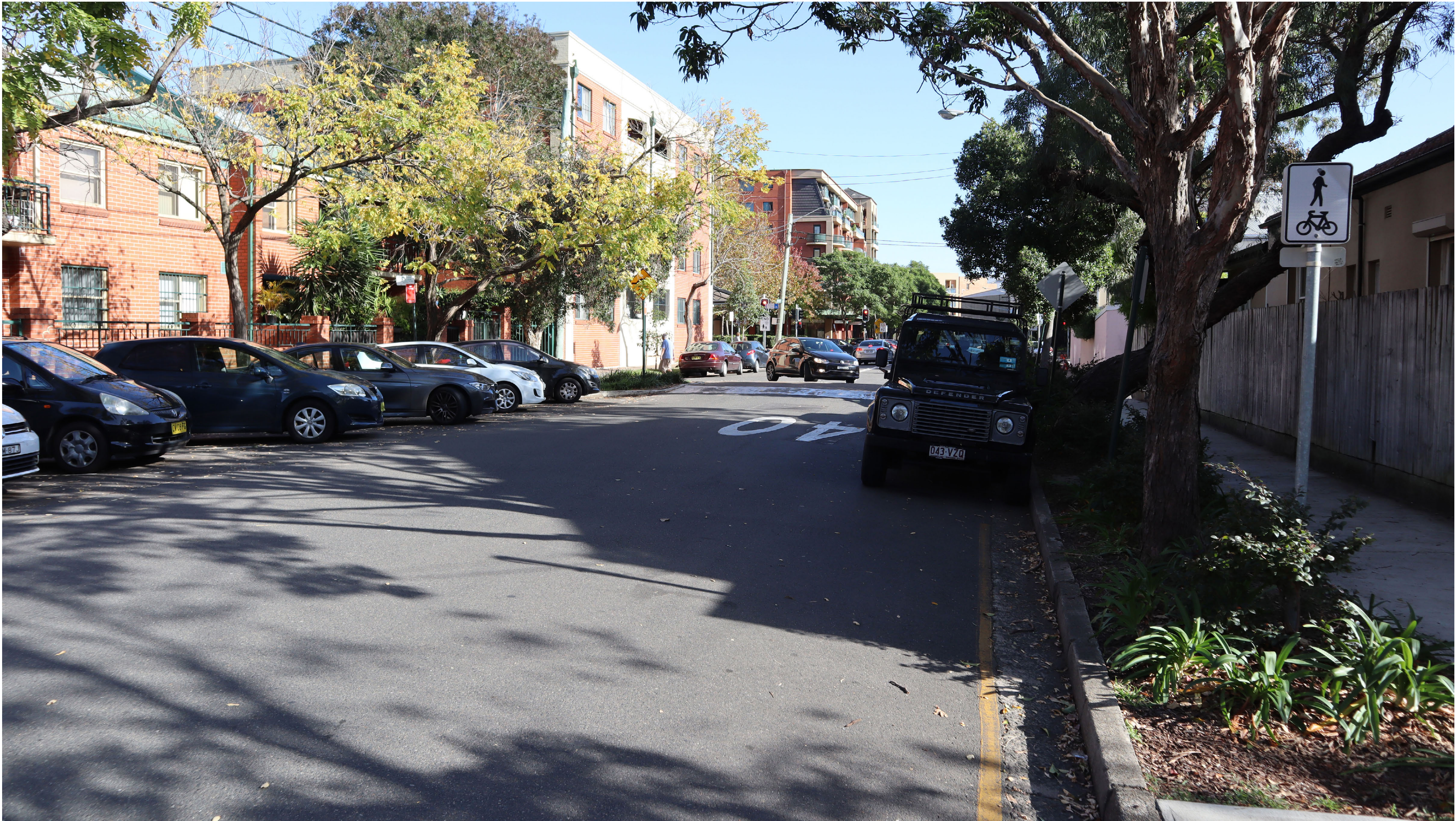
EXISTING VIEW NORTH-WEST ALONG HUNTLEY STREET NEAR BELMONT STREET INTERSECTION