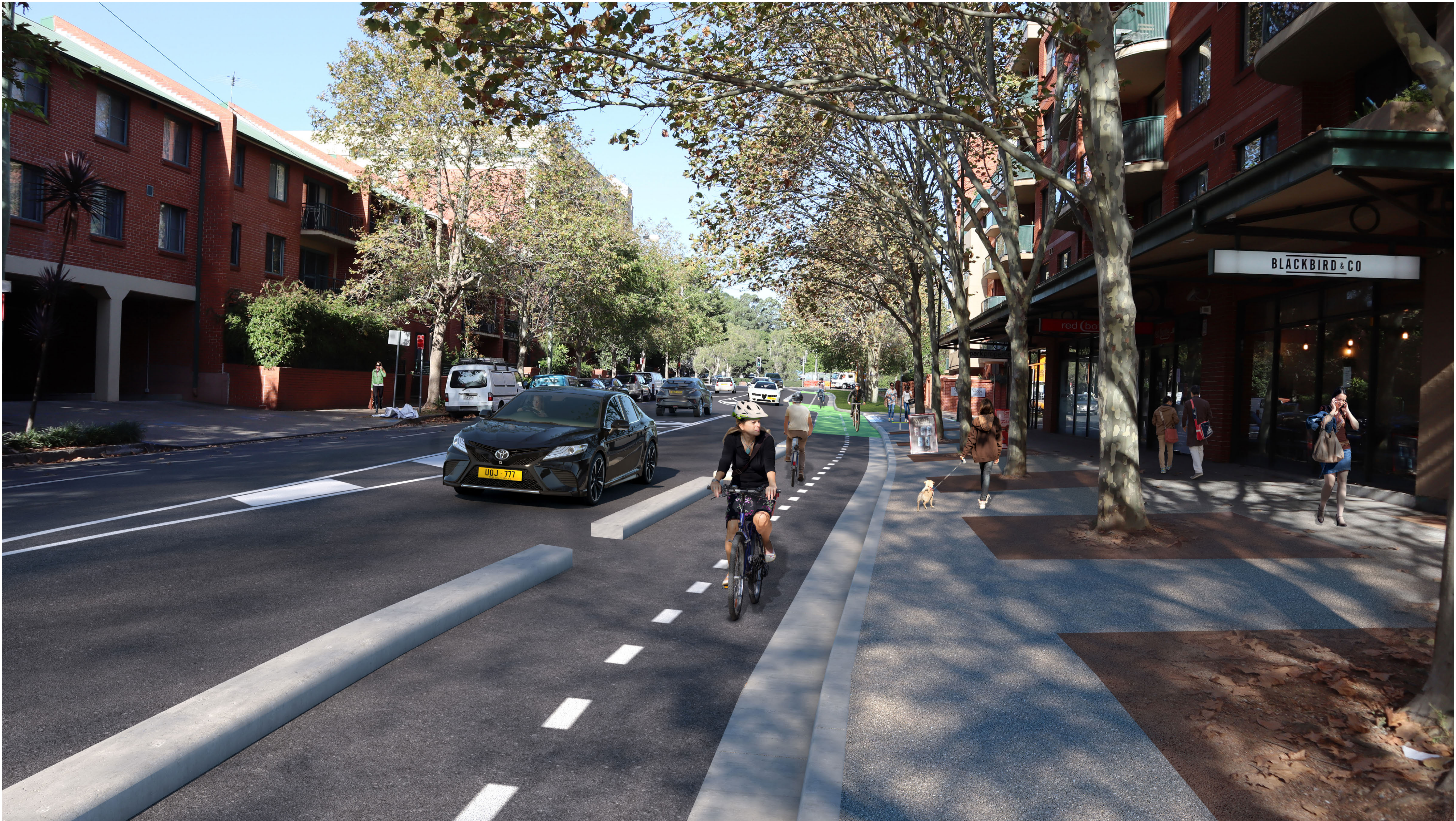
ARTIST'S IMPRESSION 1: PROPOSED VIEW OF MITCHELL ROAD LOOKING SOUTH-WEST