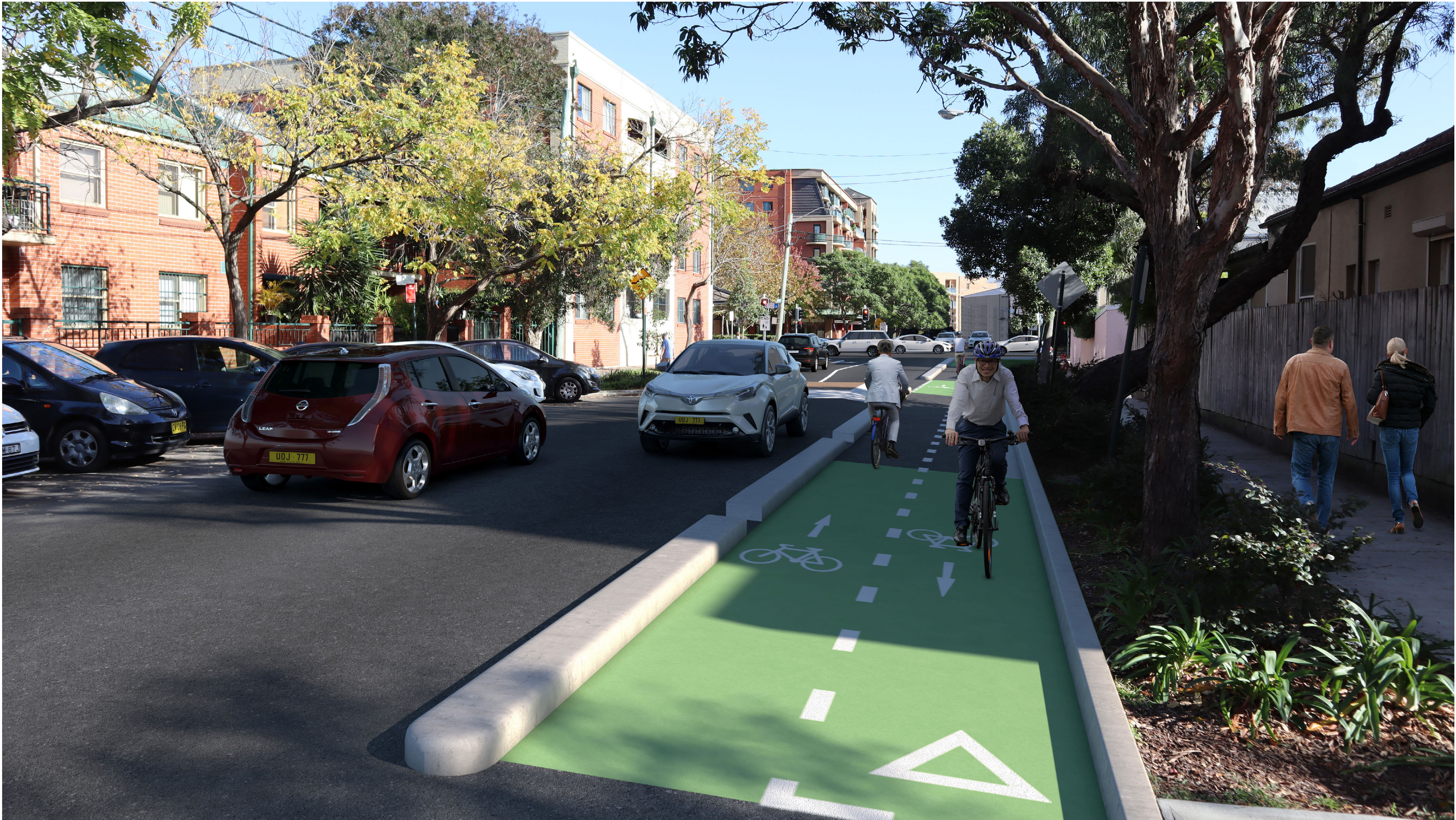
ARTIST'S IMPRESSION 2: PROPOSED VIEW NORTH-WEST ALONG HUNTLEY STREET NEAR BELMONT STREET INTERSECTION