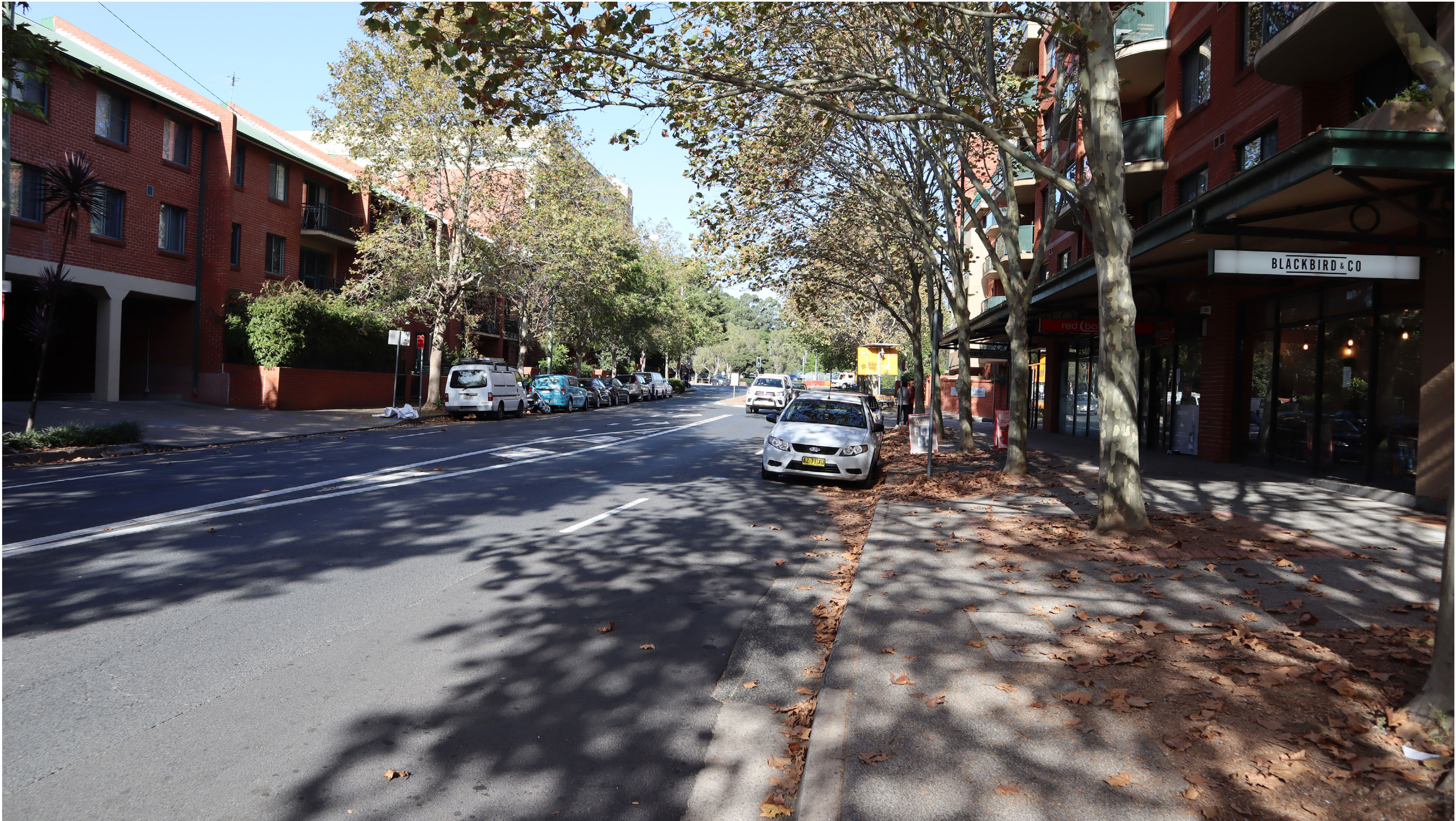
EXISTING VIEW OF MITCHELL ROAD LOOKING SOUTH-WEST