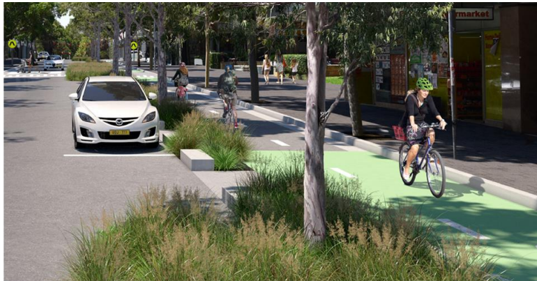
An artist's impression of the new cycleway on Crystal Street.