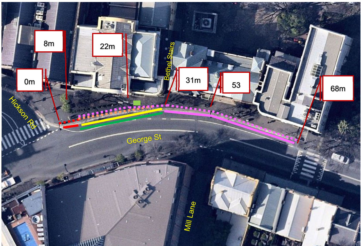
Overhead Street Photo

100 - 106 George St (East) Sydney - Proposed parking change that is currently, Place Management NSW – Taxi Zone, Loading Zone, Bus Zone to create additional parking opportunities for surrounding retailers, businesses and visitors.