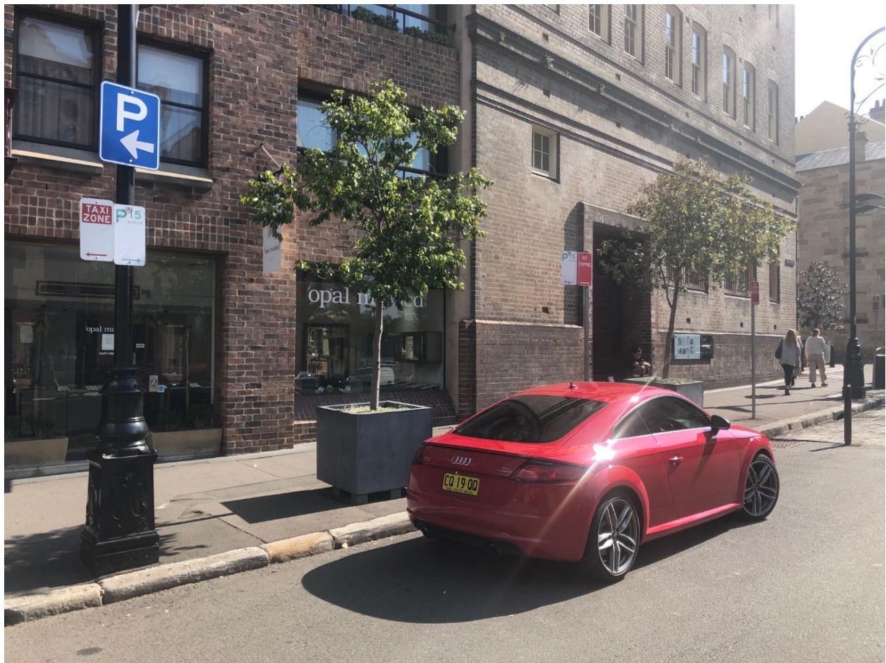
Street Level Photo