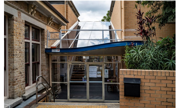
Existing Entry and Foyer