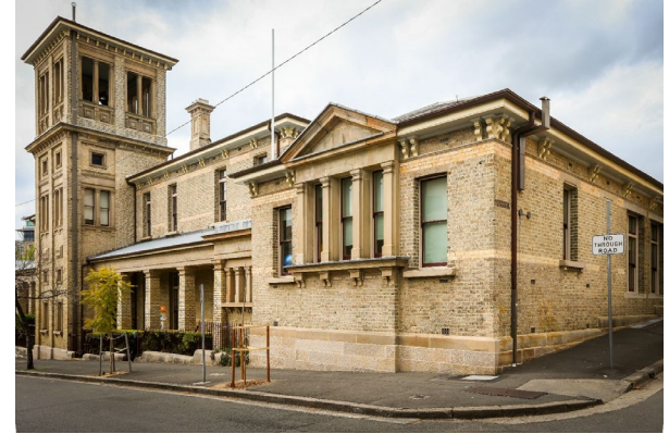
Existing Heritage Buildings on John Street