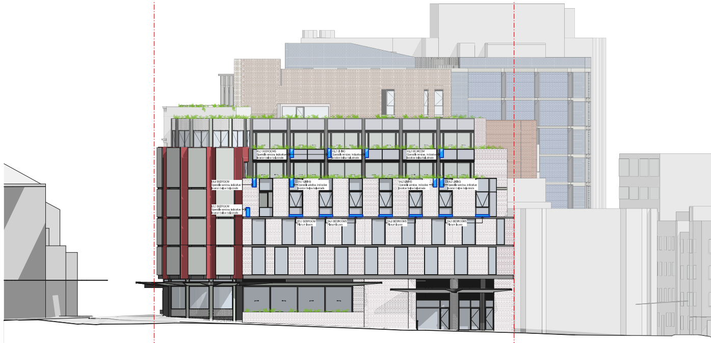
2 E2 WEST ELEVATION 1:150