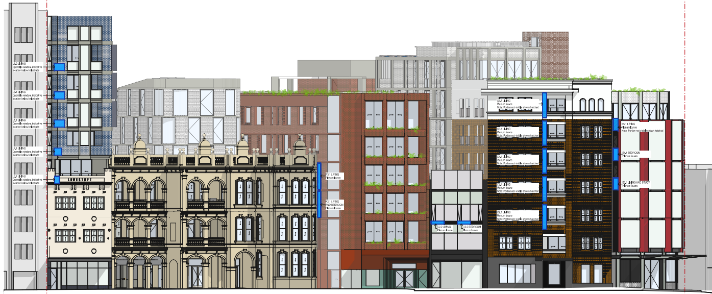
1 E1 NORTH ELEVATION 1:150