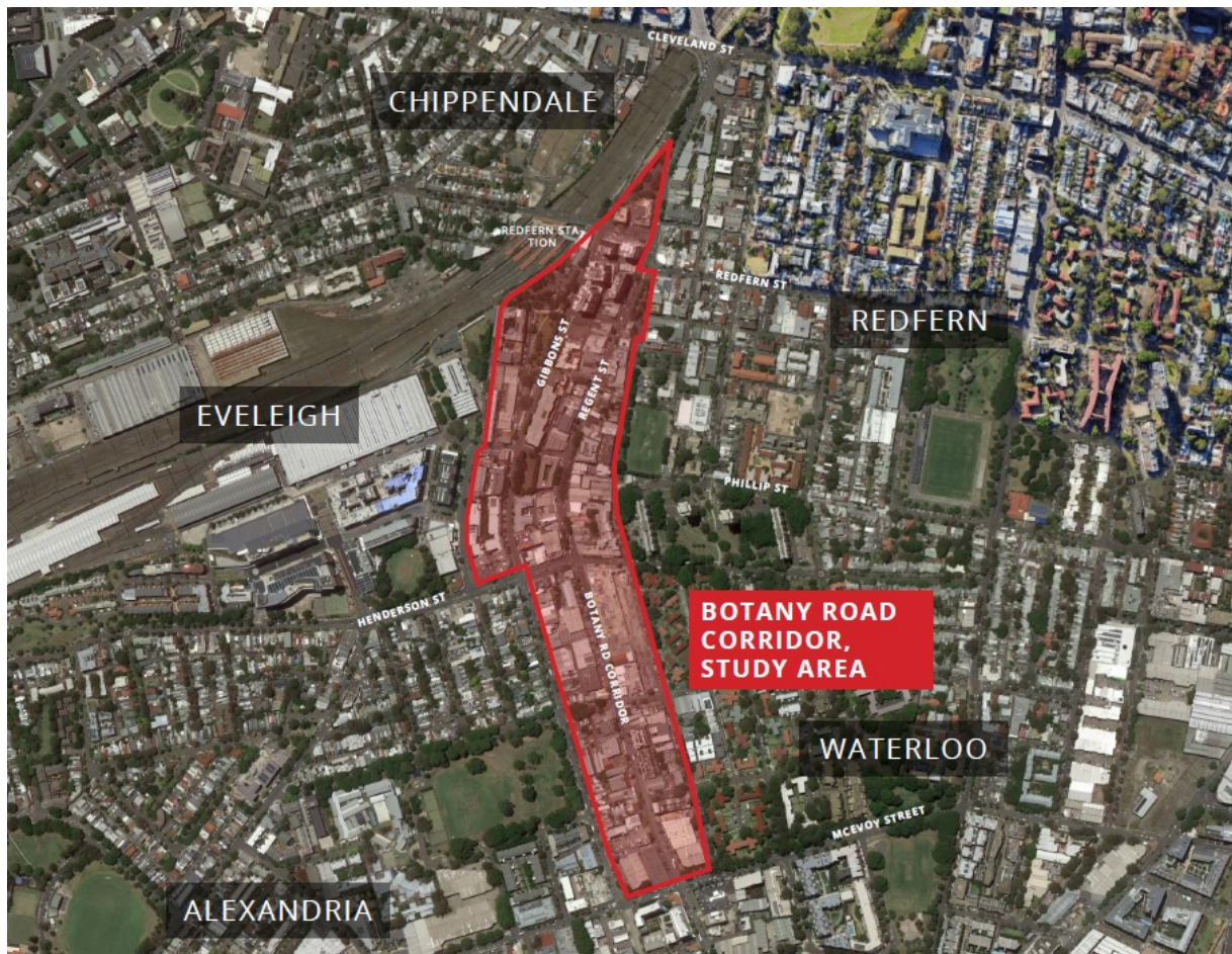
Map 1: CIR Map of the Botany Road Corridor Study Area, as updated August 2020 to include a small additional section at the top of Cope Street and Jack Floyd Reserve

The Study Area has been identified through NSW Government and City plans as a major transport hub, an ‘Innovation Corridor’ to grow employment and industry, and as an area for ‘urban transformation’. Significant targets for the area have been set in terms of employment, residential and commercial development. The City advises that it: “has identified the Botany Road corridor as an opportunity to provide much needed employment and business space including office, retail, community and cultural uses. [Through the strategic review the City is] investigating planning changes to strengthen the employment role of the area and support night and day economic, social and cultural activity and safety. This may mean changes to building height, built form and land use controls to support employment growth.” 3