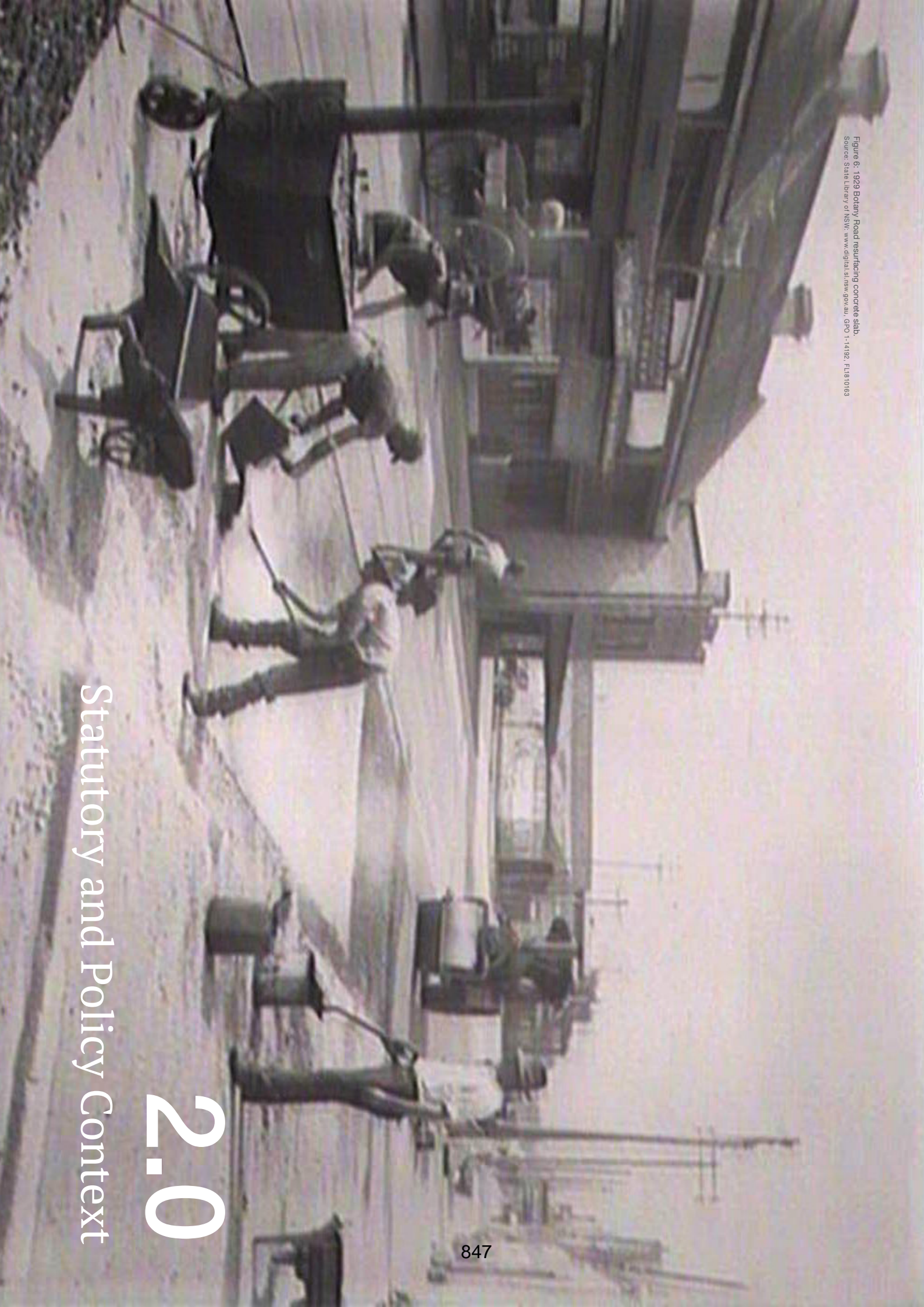
Figure 6: 1929 Botany Road resurfacing concrete slab. Source: State Library of NSW: www.digital.sl.nsw.gov.au , GPO 1-14192, FL810163