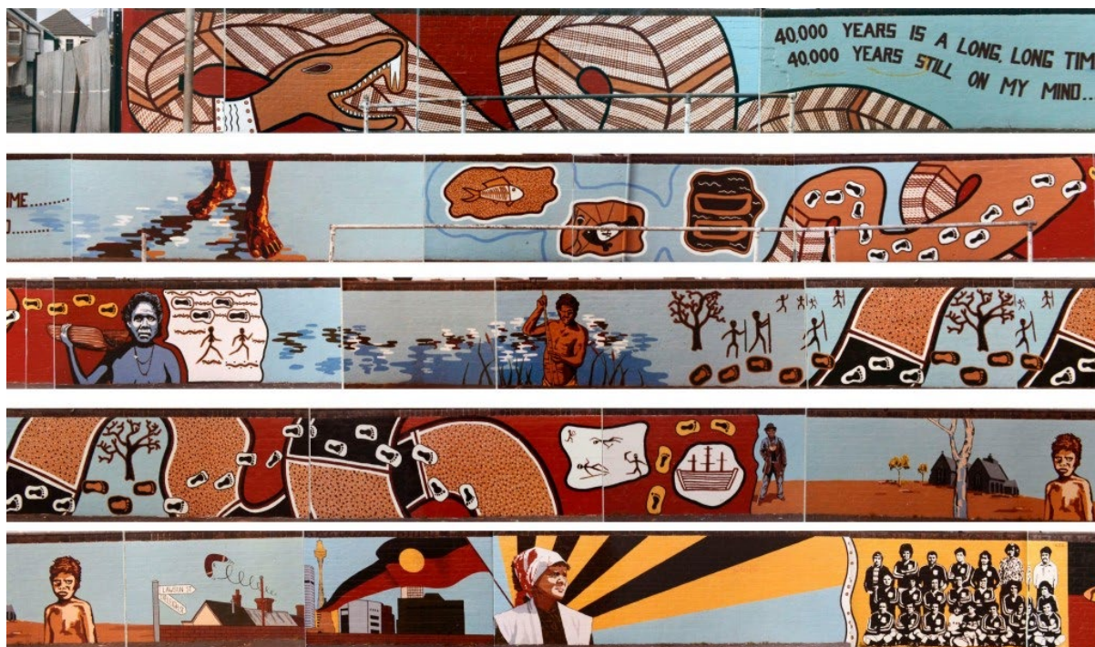
Detail of the original mural on Lawson Street, Redfern as featured in South Sydney Herald

At the same time, the number of Aboriginal community controlled organisations, or organisations working with Aboriginal communities, evolved and grew in number. Radio Redfern was established in 1981, operating out of a terrace in Cope Street (in the Study Area). Radio Redfern inspired the formation of Gadigal Information Services and Koori Radio, which was established in 1993 from a terrace in nearby Cleveland Street and today has its offices in Cope Street.