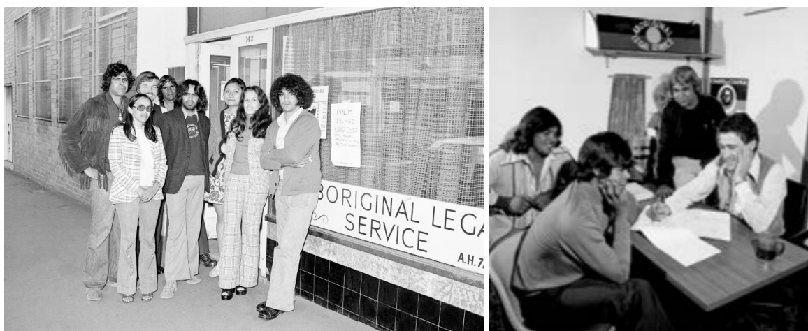
[Left] Aboriginal Legal Service shopfront in 142 Regent Street, [Right] Redfern’s Aboriginal Legal Service in 1980 featured in City of Sydney (2013)

“We started going into the Empress on a Friday night, armed with three notebooks and three pencils. And when the police began their usual Friday night activity of raiding the pub in large numbers, and arbitrarily arresting people, we started recording what they were doing. We expanded the idea of ‘Pig Patrol’ into a free shopfront, legal aid. Staffing by voluntary lawyers, on a roster basis, which would allow Aboriginal people who were being arrested, to at least mount some sort of defence ... The Redfern Aboriginal Legal Service was the first ever free legal shopfront legal centre, for anybody, in Australia.” Gary Foley, interview in the Redfern Story (documentary)