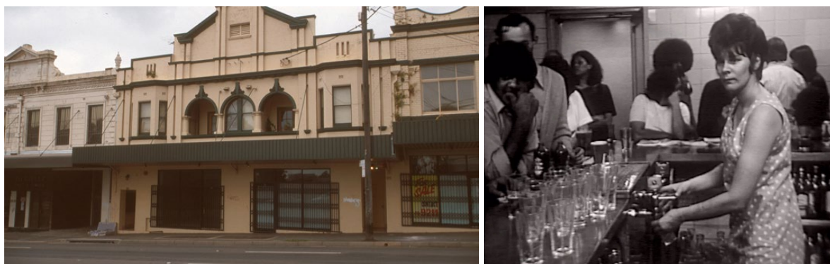
[Left] The Empress Hotel on Regent Street, 87 Regent St, repainted but intact exterior today. Photograph courtesy City of Sydney Archives - Mark Stevens Collection, 48575) [Right] Footage of inside the Empress c1970, from the Redfern Story (documentary)

Pubs where Aboriginal people were welcome to meet played an important role in the history of the area, including as sites where plans for the formation of community controlled organisations and key activist or community events were formed.