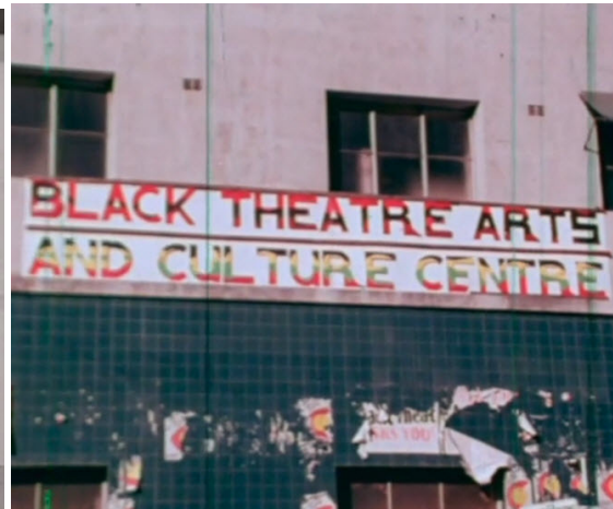
[Left] Historical sign c1972 [Right] Cope Street premises, both stills from The Redfern Story (documentary)