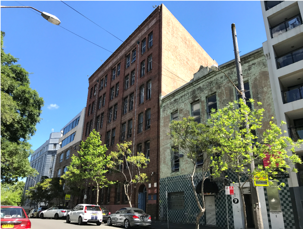
Figure 2 – Randle Street streetscape viewed from Elizabeth Street end