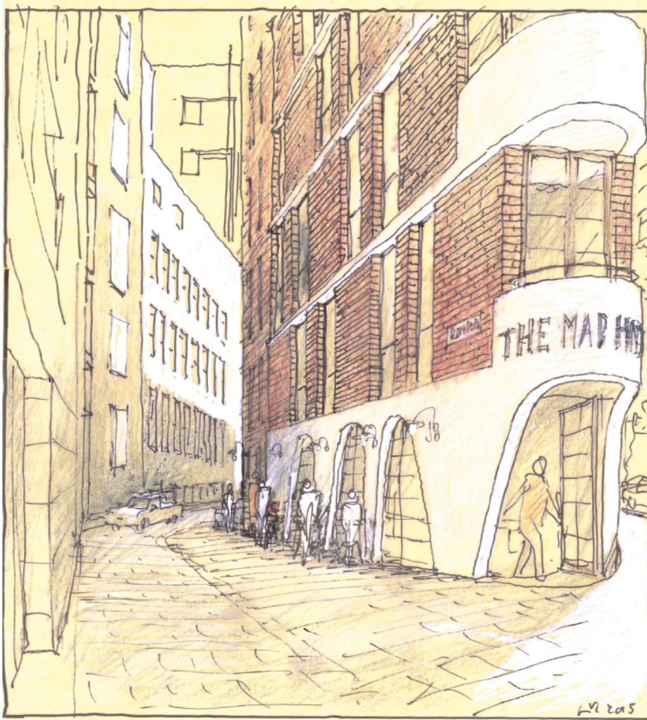
Figure 7 - Artist's impression of the proposed activated lane, converted to a shared zone, from the indicative architectural drawings