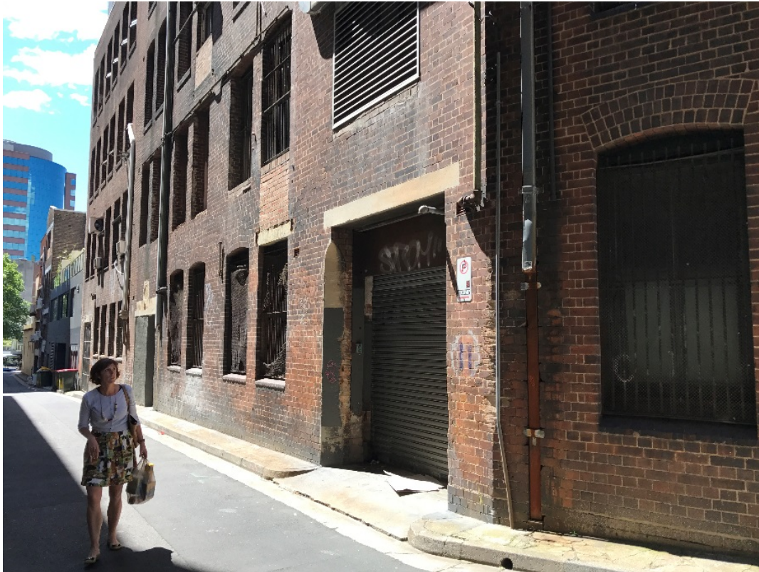
Figure 4 – Part of Randle Lane streetscape at rear of 11-13 Randle Street