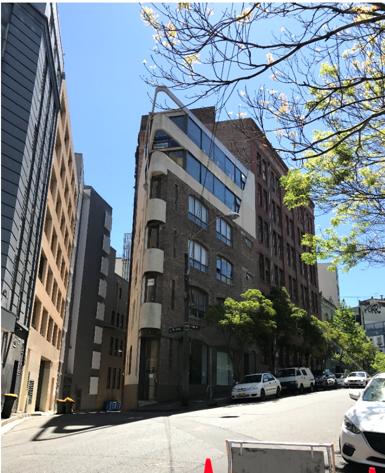
Figure 3 – Randle Street streetscape and Randle Lane corner from Chalmers Street end