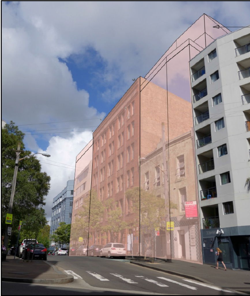
Figure 8 – Street view of proposed building envelope from intersection of Elizabeth and Randle Streets