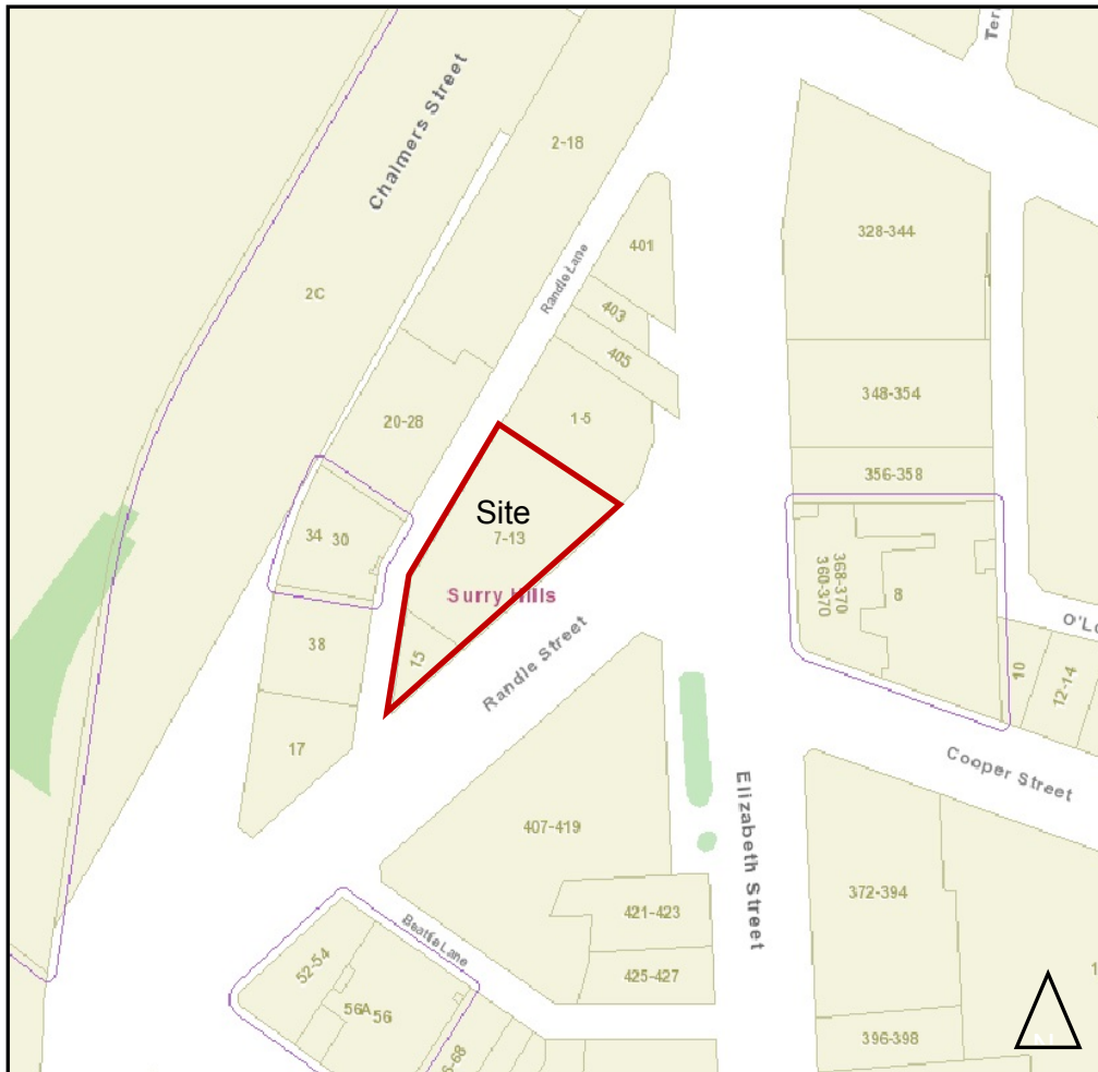
Figure 1 – Location of 7-15 Randle Street, Surry Hills