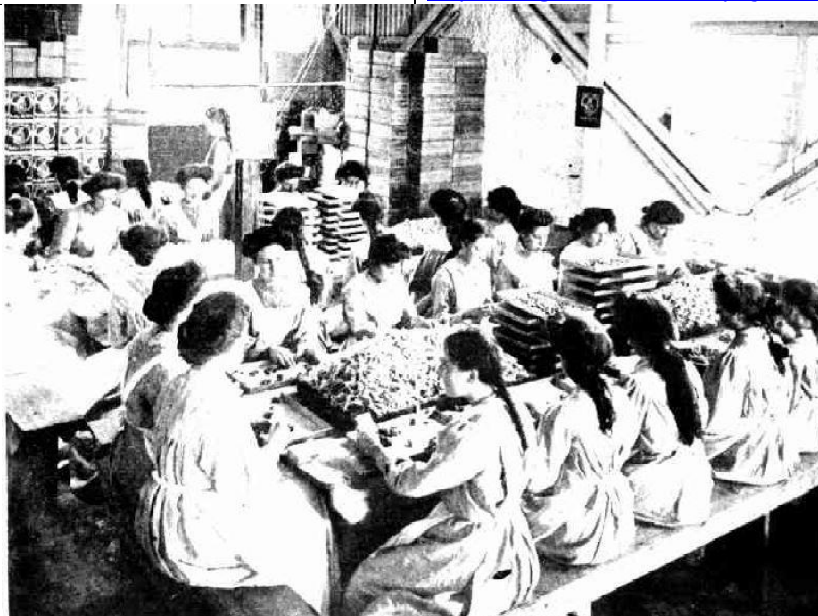
Wrapping Honey Kisses at James Henderson & Son's factory, 1905.