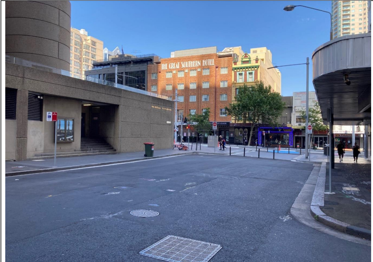
Barlow Street – 2019 prior to temporary art installation (looking toward George Street)