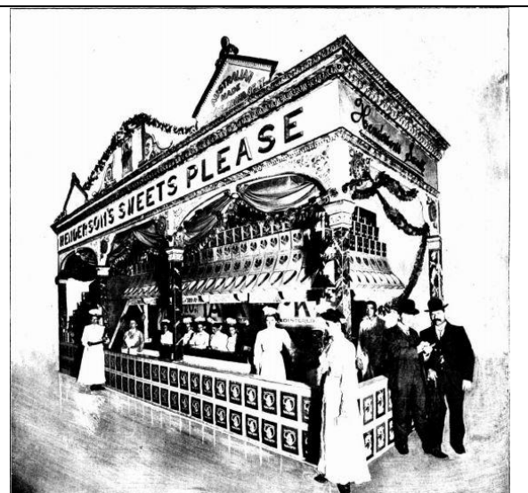
Henderson's Sweets display at an industrial exhibition, 1906, with the advertising logo lining the booth.