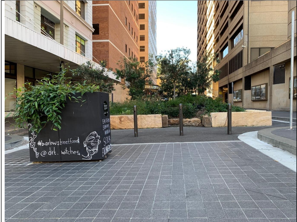
Barlow Street - "Barlow Street Forest" Temporary Art Installation (view from George Street)