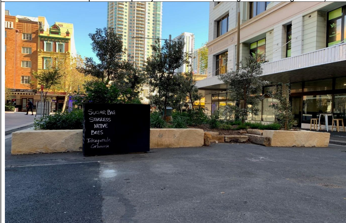
Barlow Street – “Barlow Street Forest” Temporary Art Installation (view from Parker Street)