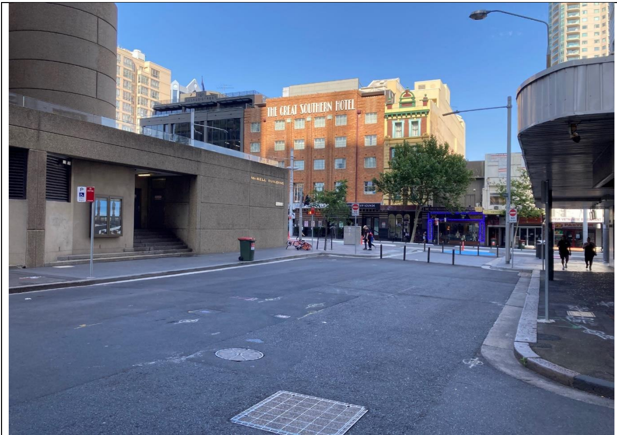
Barlow Street – 2019 prior to temporary art installation (looking toward George Street)