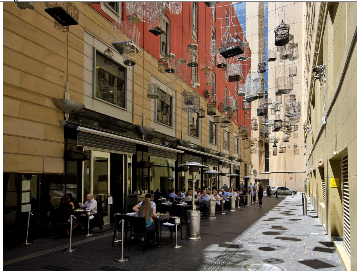
Angel Place (completed 2011)