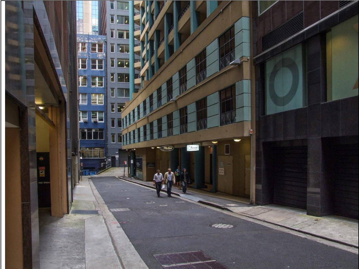
Hosking Place before