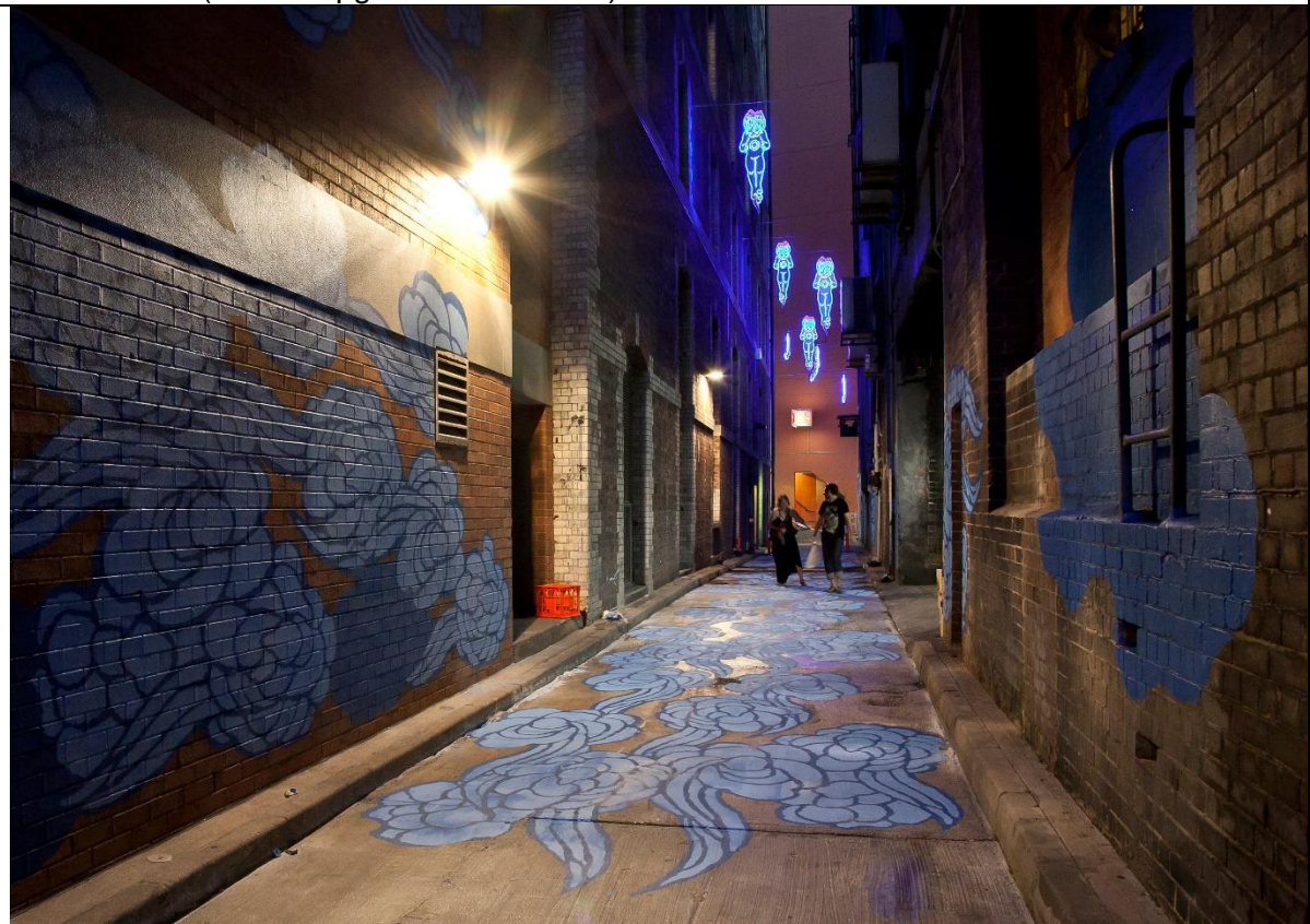
Kimber Lane completed 2012