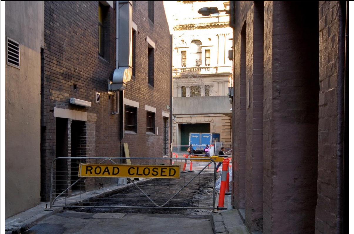
Market Row construction 2010