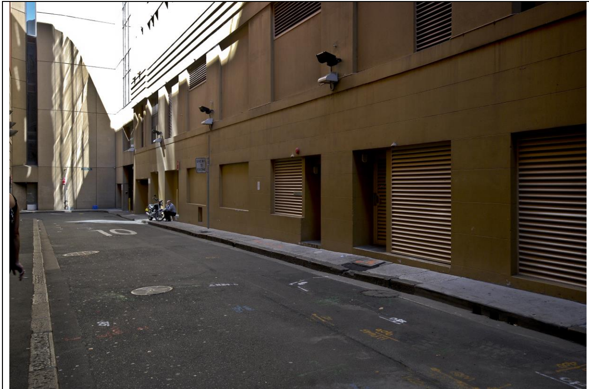
Angel Place before