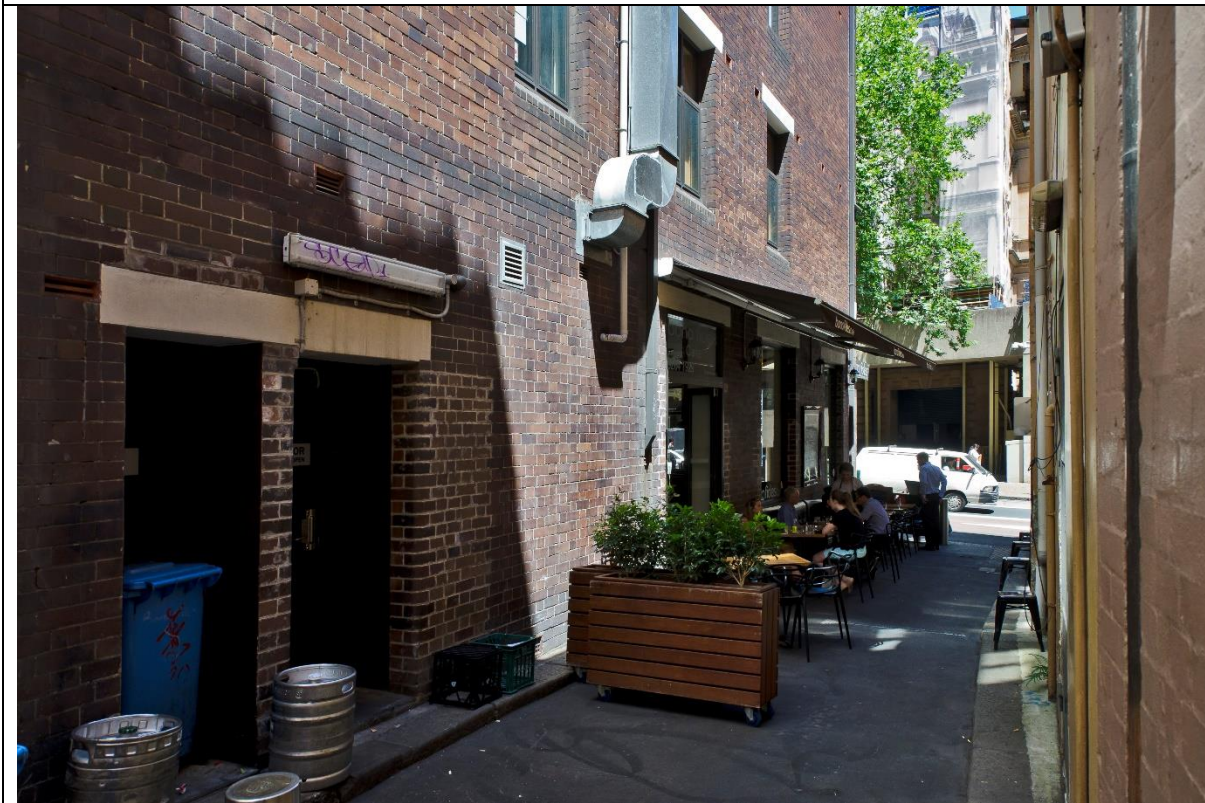
Market Row completed 2011