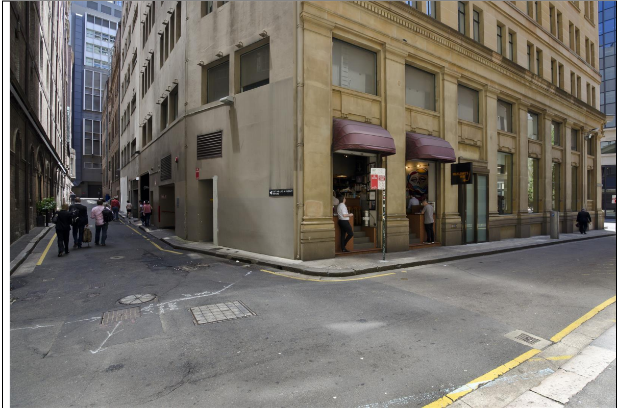
Bridge Lane and Tank Stream Way before