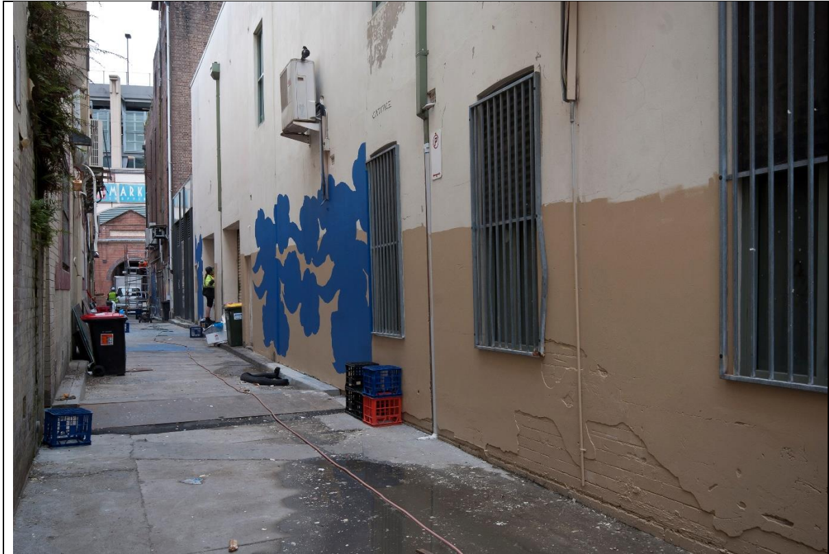
Kimber Lane (start of upgrade works 2011)