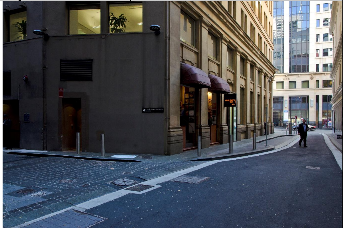
Bridge Lane and Tank Stream Way completed 2014