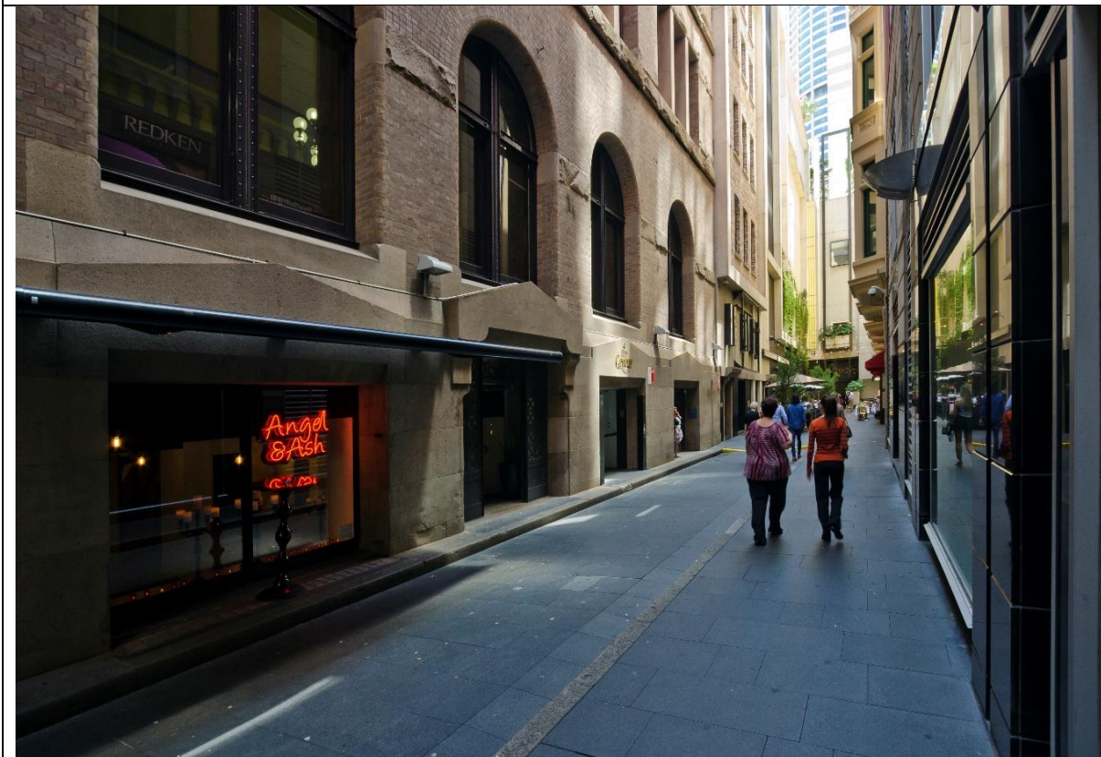
Ash Street (completed 2011)