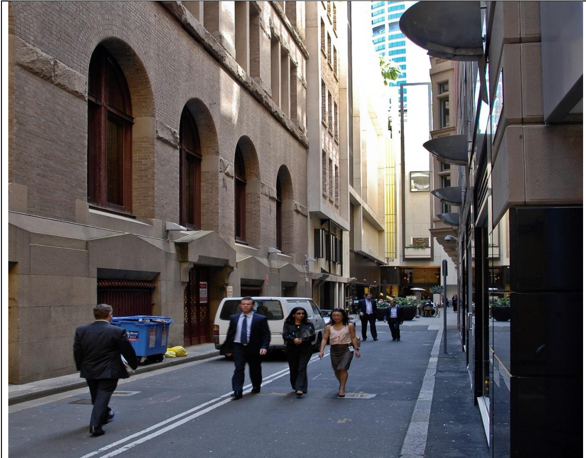
Ash Street before