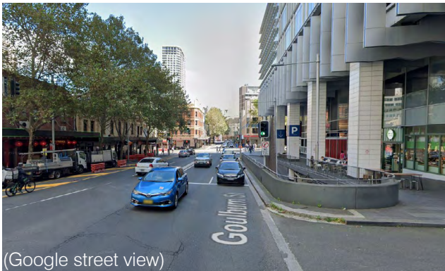
(Google street view)