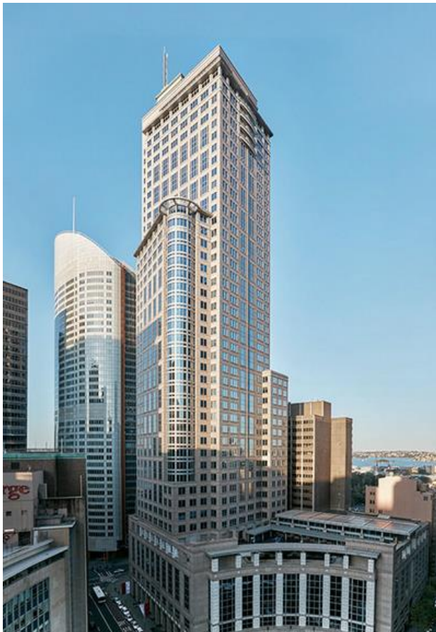
Figure 3: Existing Chifley Tower and podium (source: Chifley website)