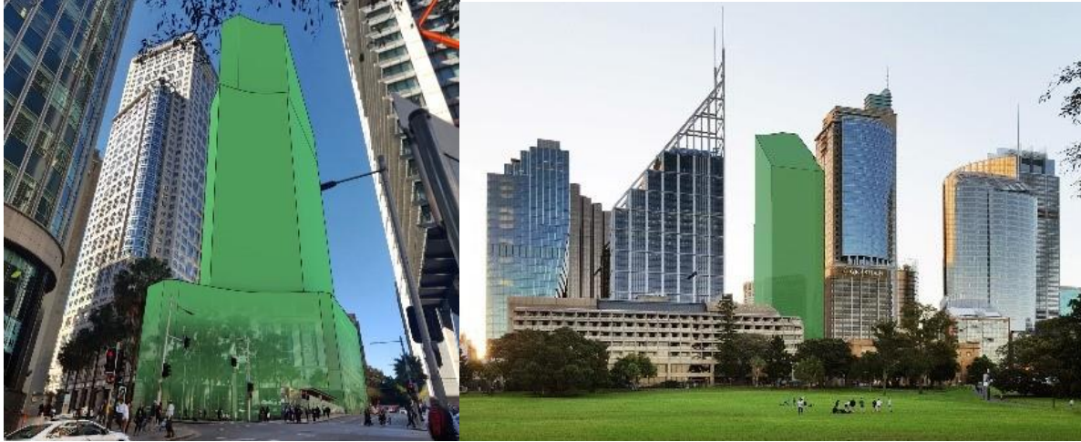
Figure 8: View analysis of the planning envelope looking from Hunter Street to the east (left) and from The Domain (right)