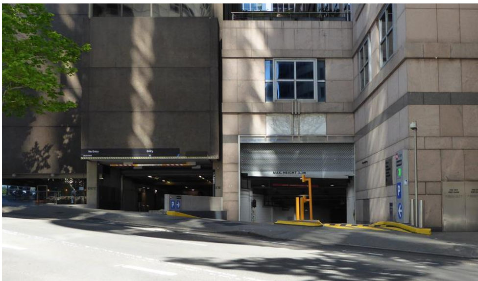
Figure 9: Driveway access to the site, with the driveway for 167 Macquarie Street to the left