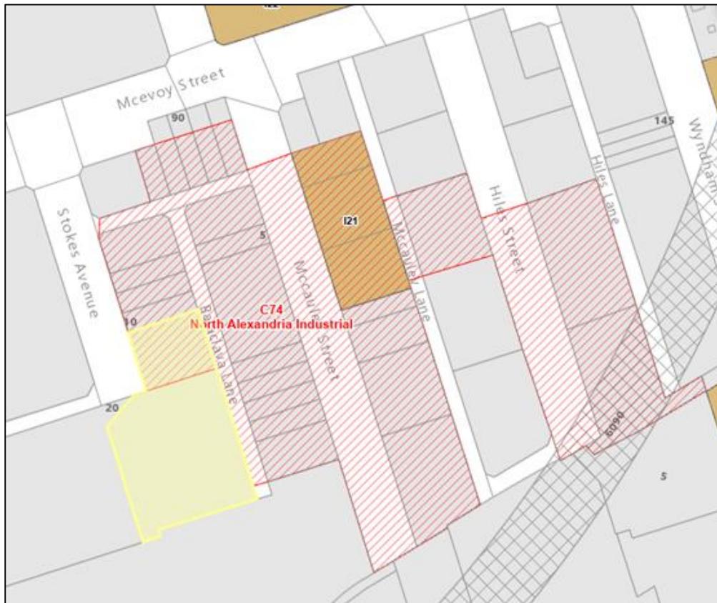
Figure 2 North Alexandria Industrial Heritage Conservation Area (site shown in yellow, conservation area in hatched red)

The property is partly within and partly adjoins the North Alexandria Industrial Heritage Conservation Area (see Figure 2).