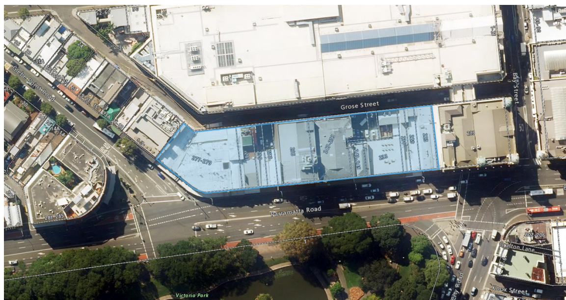
Figure 2: Aerial photograph of site