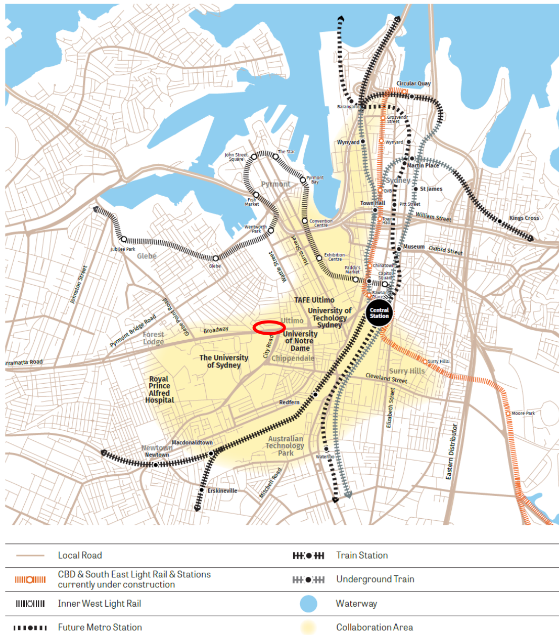
Figure 4: Camperdown-Ultimo Collaboration Area with site circled in red