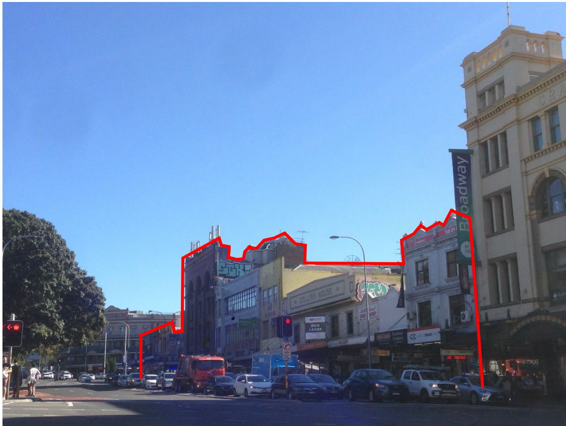
Figure 3: View of the site outlined in red looking west along Broadway