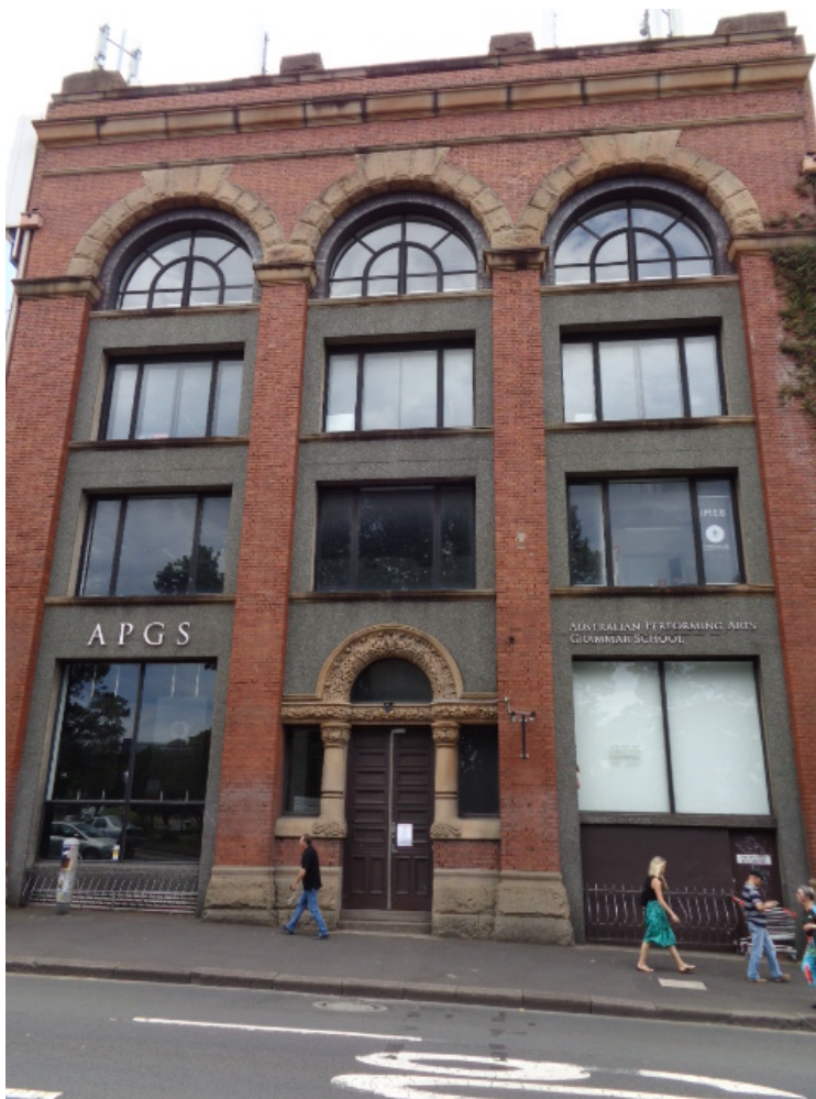
Figure 8: Proposed heritage item at 255 Broadway