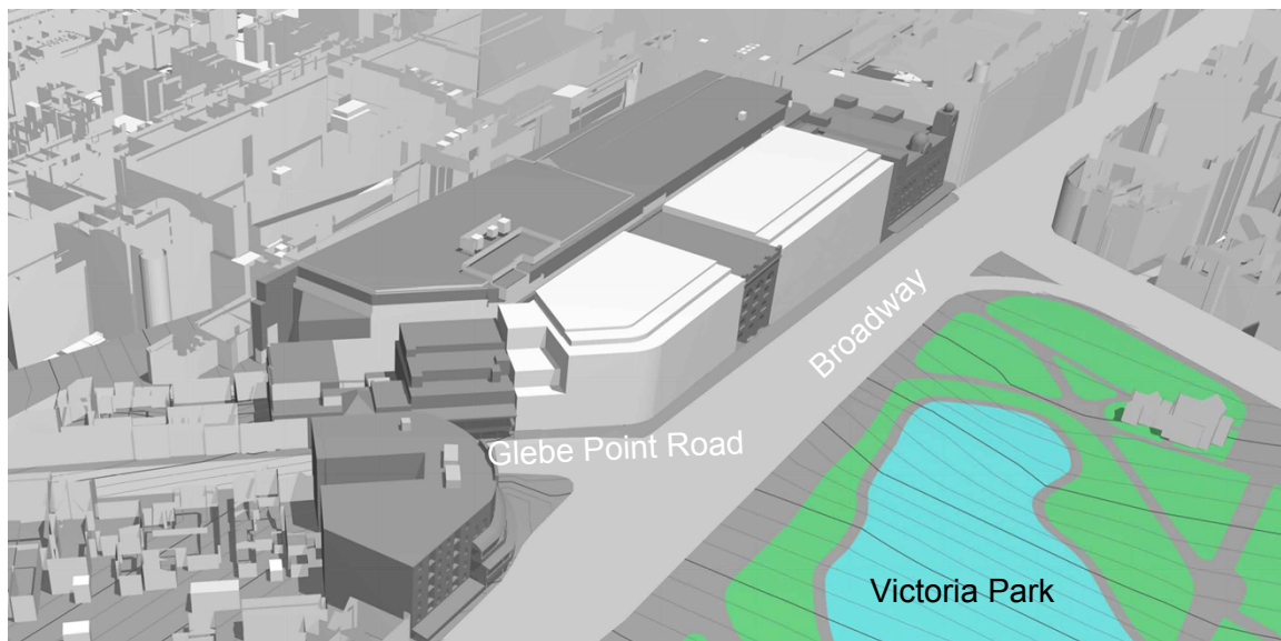
Figure 5: Proposed built form envelope with the site shown white