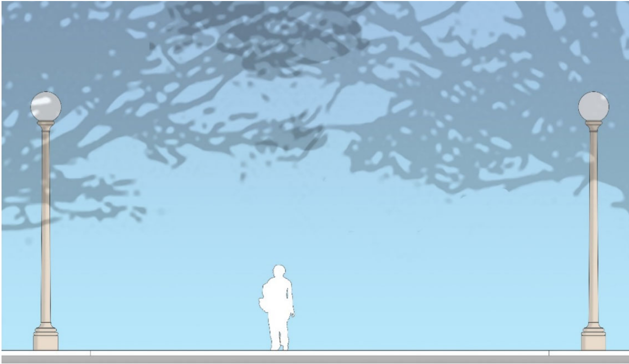
Hyde Park primary paths – double post top lighting arrangement