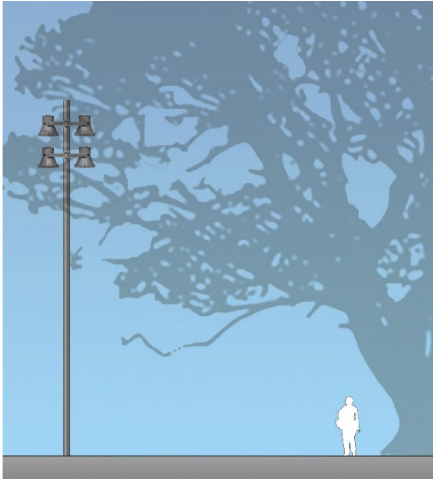
Hyde Park lawn areas – mast lighting