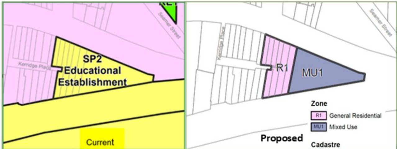
Figure 4. Existing and proposed zoning for the site

Figure 4 below is indicative of how this planning proposal would amend sheet LZN_009 of the Land Zoning Map as adopted by the Sydney LEP.