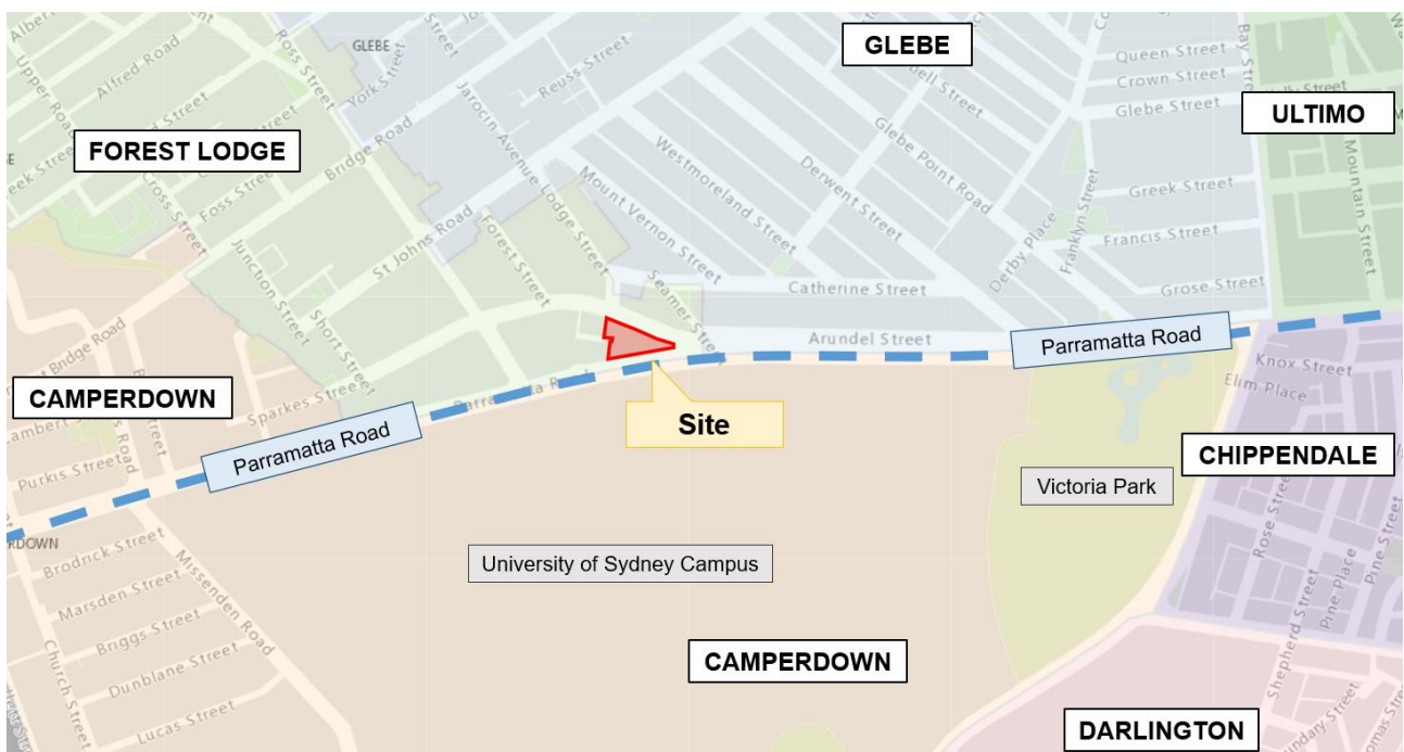
Figure 2. Site context and suburb boundaries

The properties are located within Forest Lodge, in close proximity to Central Sydney. The area north of the site is predominantly residential and development is characterised by typical Victorian one and two storey terrace houses. The area south of the site, across Parramatta Road, is the University of Sydney campus. The properties form an acute triangle shape at the intersection of Parramatta Road and Arundel Street. The context is shown in Figure 2 below.