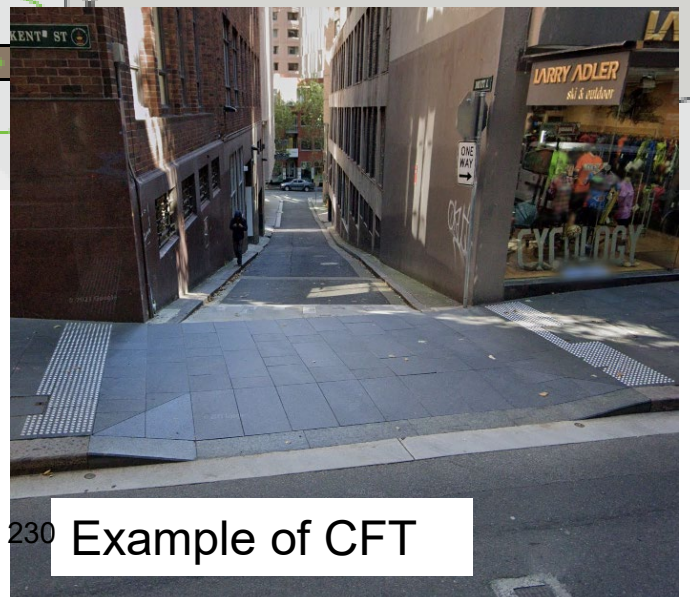
Example of CFT