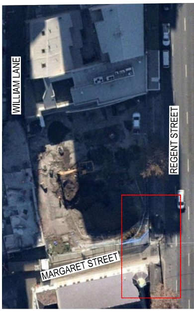
LOCATION PLAN SCALE 1:350